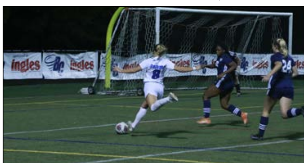
Women's soccer is the winner! Let's go!

Be sure to come to Ives-Lemel Family Field as the Tornados take on William Peace and celebrate senior day.