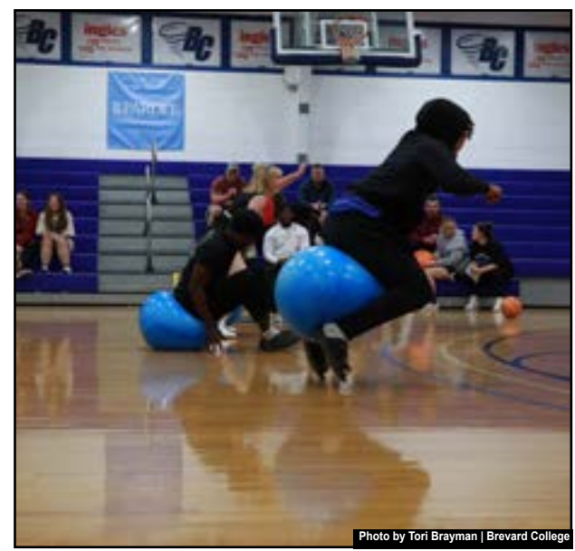
The different teams competed against each other in many events like the ball race with a basketball shot to be made at the end.