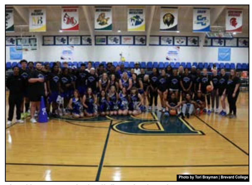
The athletes at Tornado Tip Off all together for a photo!