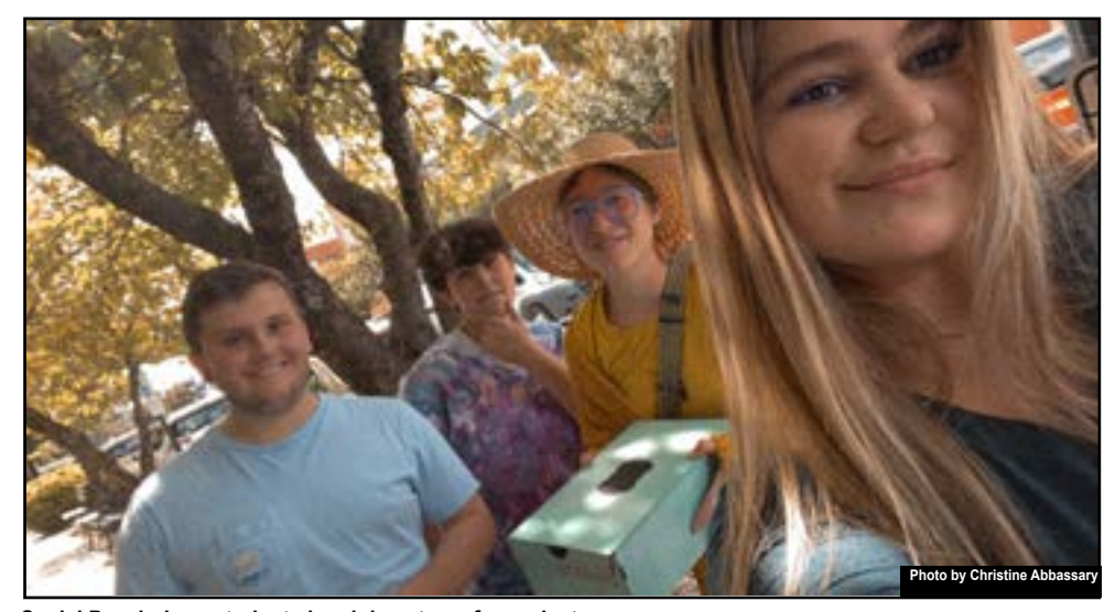
Social Psychology students head downtown for project

care. You may also see our videos posted in the Happy holidays Brevard College compilation, "Wishing you a very happy, especially healthy holiday season."