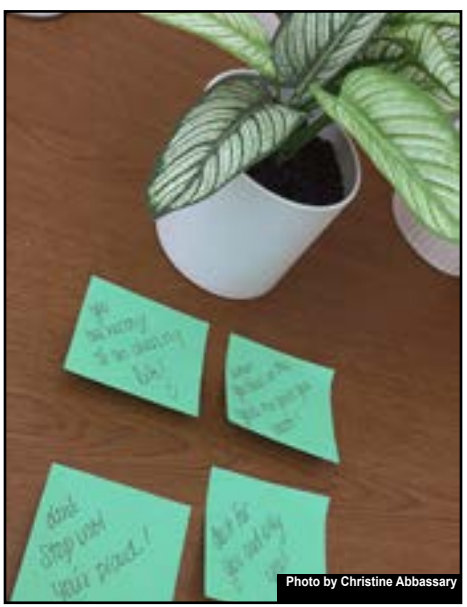
Examples of student notes