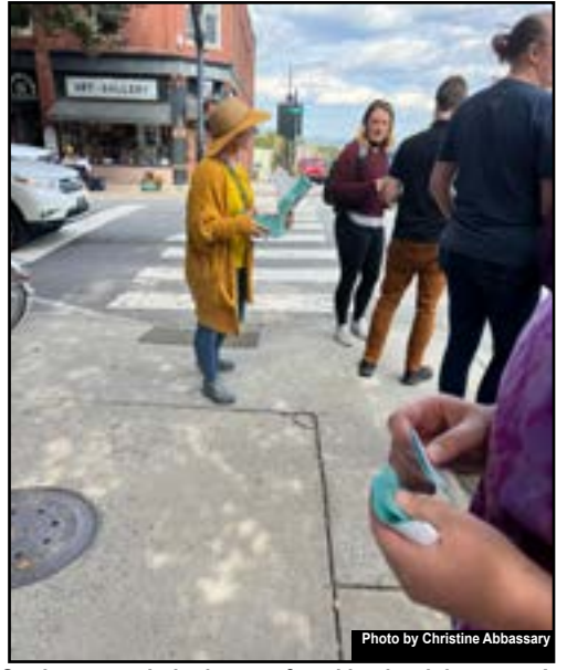
Students caught in the act of working hard downtown!