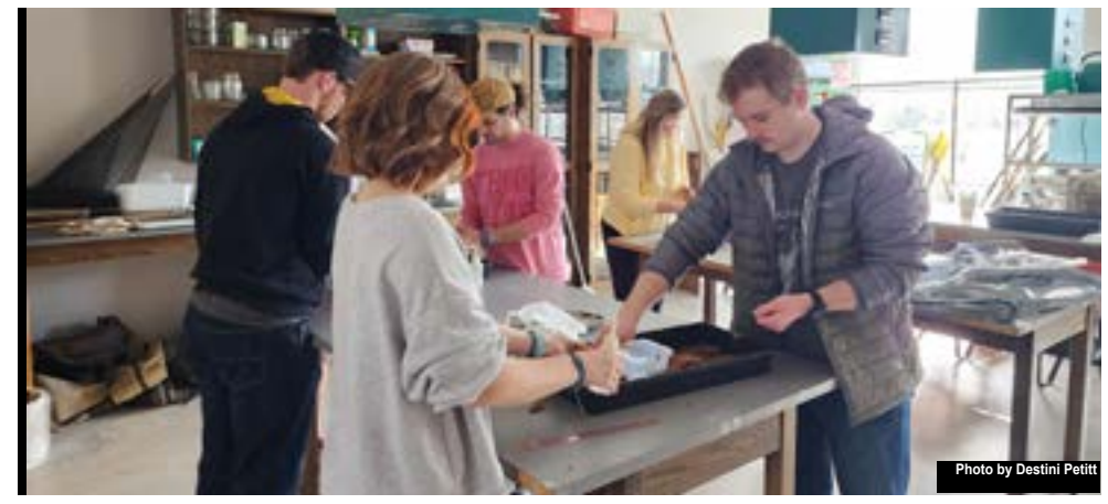
Plant Production students practicing classification of soil texture.