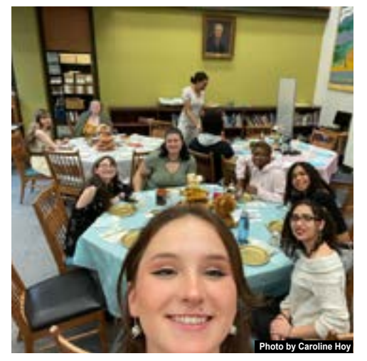
In the front is The Chronicles Narnia table, in the back left is the Pride and Prejucide table and in the back right is the Alice in Wonderland .

Knowing the books themselves was not a mandatory for the event. The event was just held for fun and boy did students have fun! BC would love to have a tea party again!