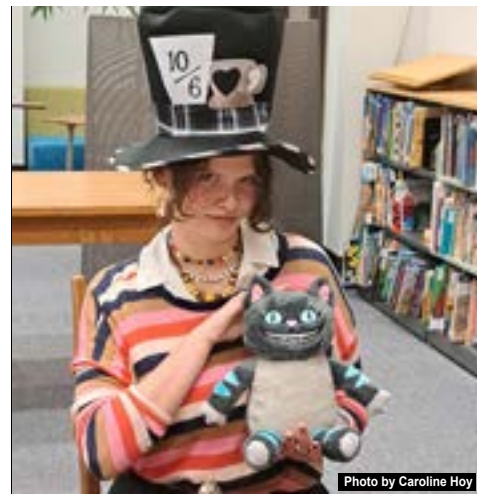
Student at the Alice in Wonderland table came prepared.