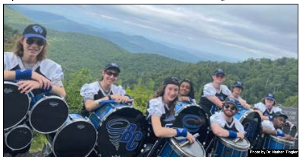
BC Drumline meets on top of the Parkway to watch the sunrise!

Come out and see them play at the football game Saturday at 2 p.m., or come to the tailgate at 12 p.m. If you can't make it to the game, make sure to check out the Drumline Facebook page, BC Tornado Drumline Youtube Page, or the soon to be BC Drumline Instagram!