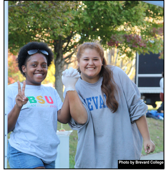
Halloweek kicks off with Harvest Fest! Two students enjoy makinging the hand wax sculptures.