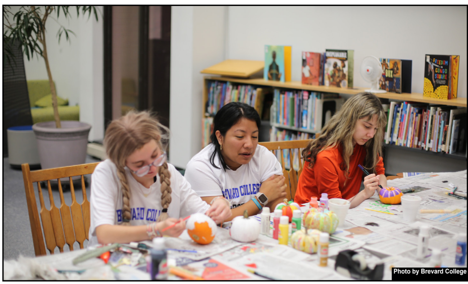
Students enjoy painting their pumpkins in the library.