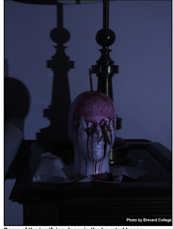
Some of the terrifying decor in the haunted house.