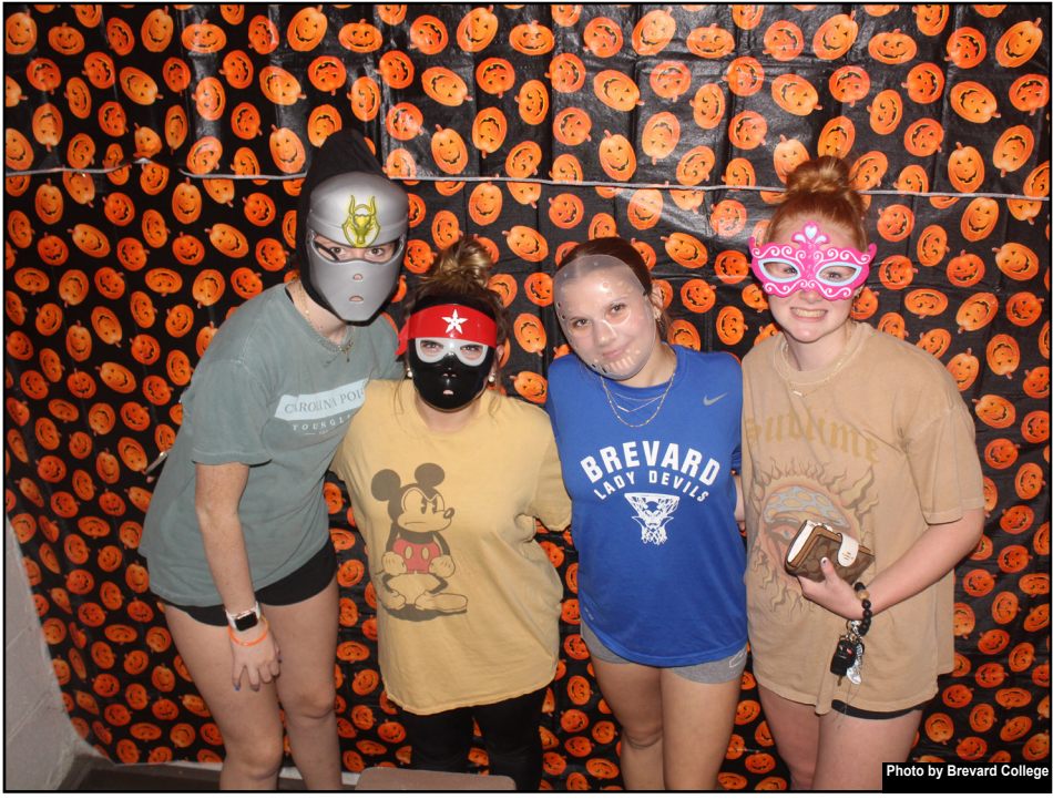
Students are terrified after this haunted experience!