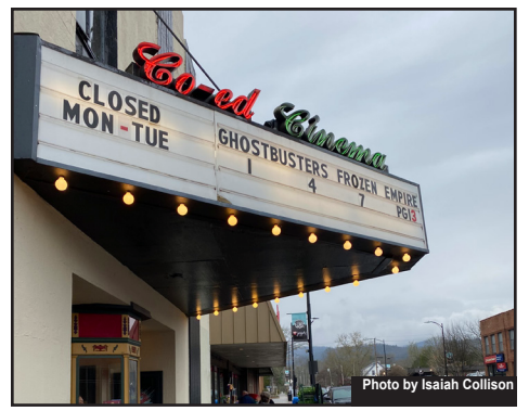
The view right before you walk into the Co-Ed Cinema.

the roses and remember what we're so busily striving for.