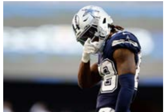
Photo of CeeDee Lamb at Cowboys game

Lamb has opened the door for many other receivers who are looking to get paid and expect that top dollar for years to come.