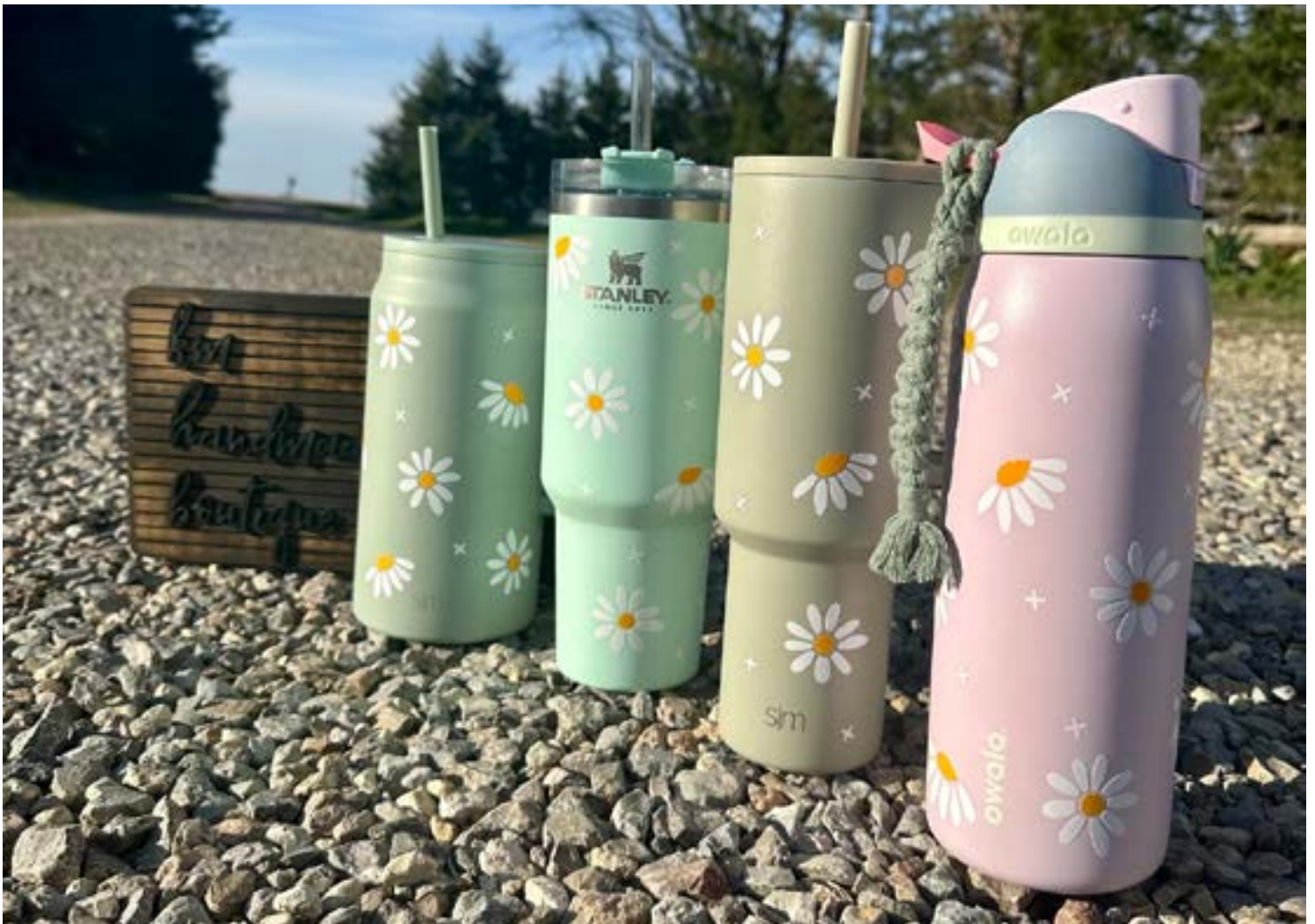
Image of Stanley, Owala, and other trending style water bottles.