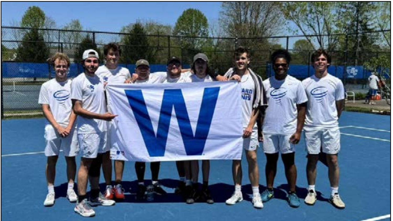
Last year's Brevard College tennis team.

This is sure to be an exciting year for the tennis team. Not only for team dynamics but to see the results of their hard work and determination as well. We wish you luck!