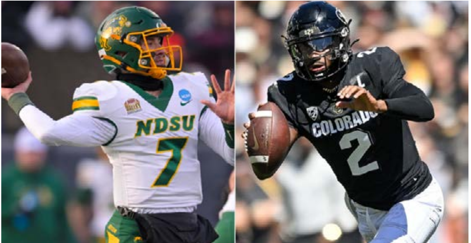
Cam Miller (number 7) North Dakota State quarterback and Shedeur Sanders (number 2) Colorado quarterback.

Other big performances around the country saw Jaxon Dart throwing for 418 yards and 5 touchdowns against Furman winning 76-0. For Arizona, quarterback Noah Fifita threw for 422 yards and 4 touchdowns, while receiver Tetiaroa McMillian went for a whopping 10 catches, 304 yards, and 4 touchdowns.