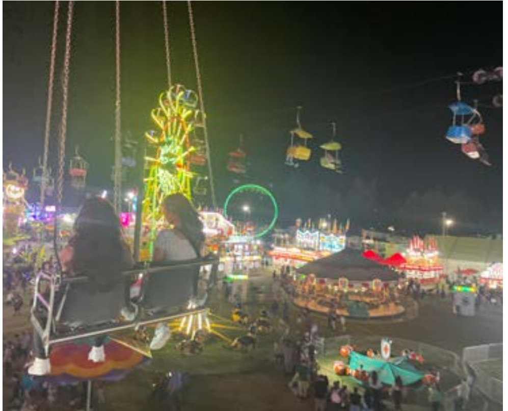
View from the swing ride at last year’s N.C. Mountain State Fair.

Midway provider Drew Expositions brings 36 rides to fill the grounds with offerings for the youngest to the most adventurous of riders. Ride-all-day-for-one-price hand stamps are available every day of the Fair. Prices are $35 for Fridays, Saturdays and Sundays and $25 for Mondays through Thursdays. Vouchers