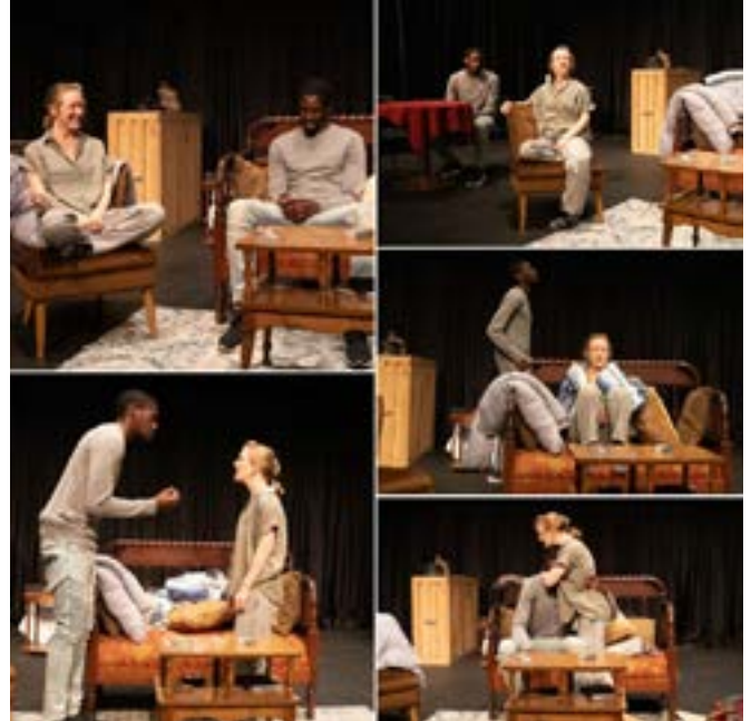
BC Theatre posted these photos from their production of "Fishtown" on their Facebook page, https://www.facebook.com/BrevardCollegeTheatre .

Brevard College Theatre Department is thrilled