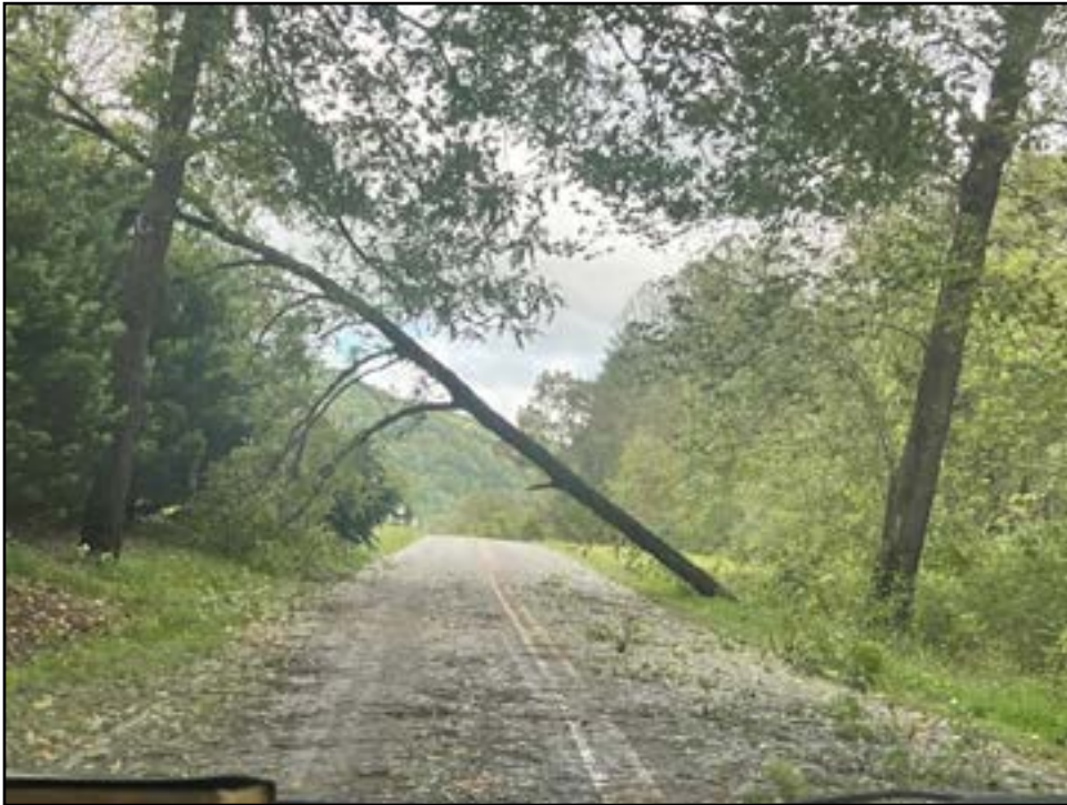
A fallen tree on old US 64.