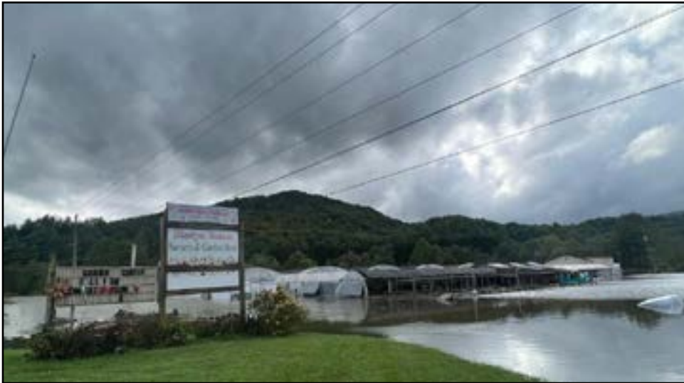
Clouds loom over a flooded greenhouse in Mills River.