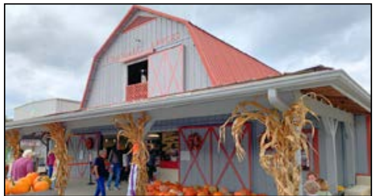
Grandad’s Apple farm store with all of your fall needs.

At the bakery, my all time favorites are their apple cinnamon donuts and their apple cider slushie. I had a lovely lady recommend the fried apple pie and it did