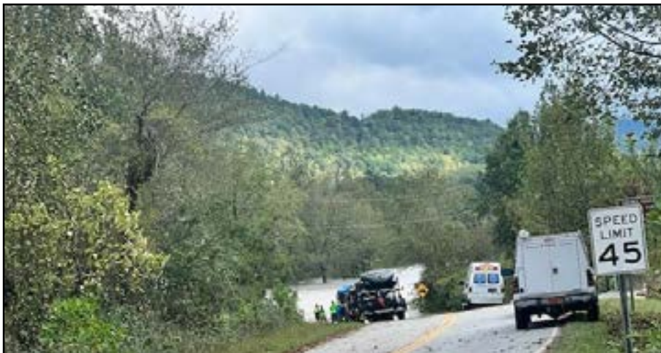
Crab Creek Rd. flooded as emergency workers prepare rafts to rescue victims.