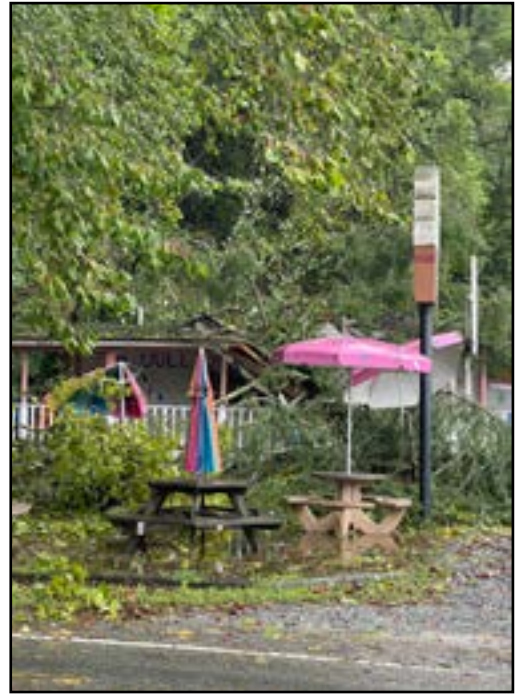
Dolly's Ice Cream Shop building at the entrance to Pisgah National Forest was demolished by fallen trees.