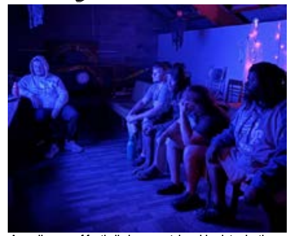
A small group of football players watch a video introduction for the Inferno of Insanity haunted house in the attic of MG.

Happy Dia de los Muertos! (or "Day of the Dead," if your Spanish is a bit rusty.)