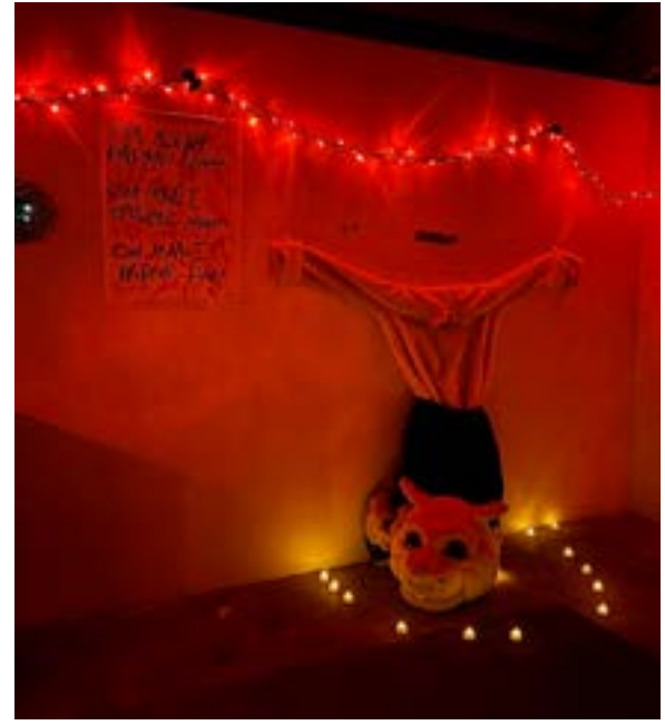
Even our beloved Nado falls victim to criminal insanity.