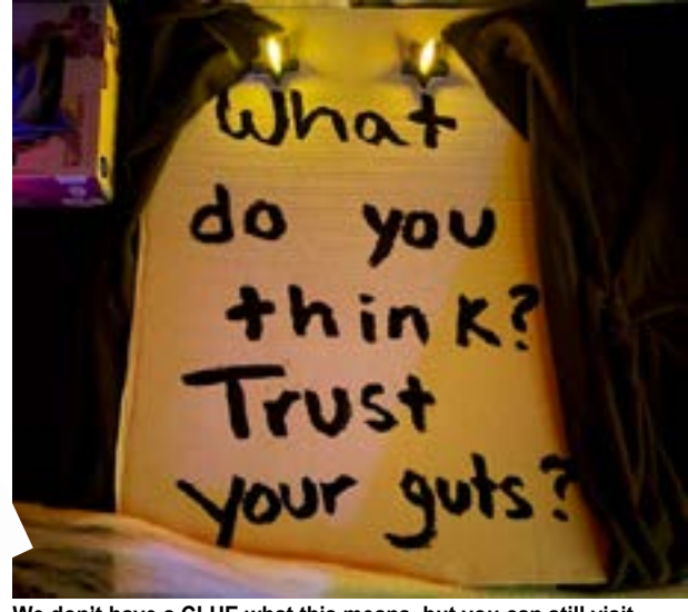
We don't have a CLUE what this means, but you can still visit tonight to find out for yourself.