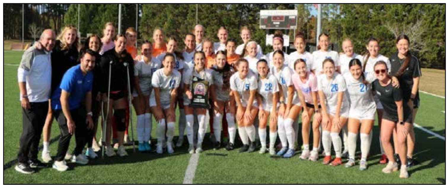
The Brevard College women's soccer team pose with a trophy Saturday commemorating their unbeaten season and regular season championship, the first regular season trophy by any BC team since joining the NCAA. They will open the USA South Conference Tournament at home tomorrow against William Peace at 5 p.m.