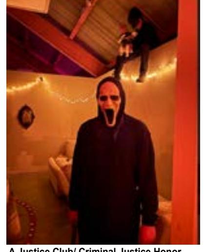
A Justice Club/ Criminal Justice Honor Society member stands by ready to scare.