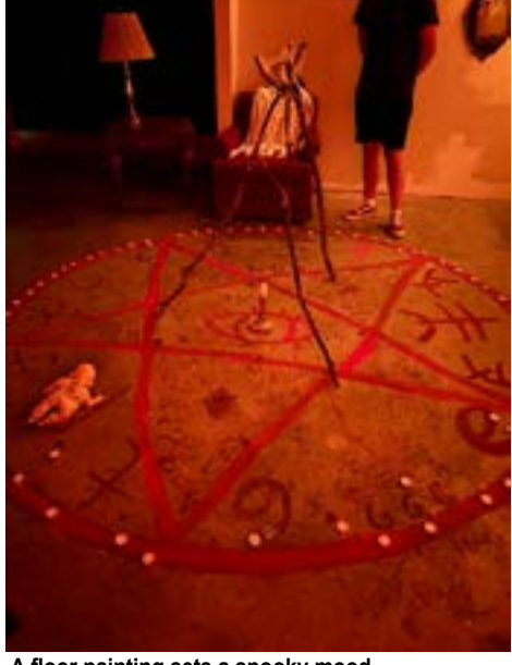
A floor painting sets a spooky mood.