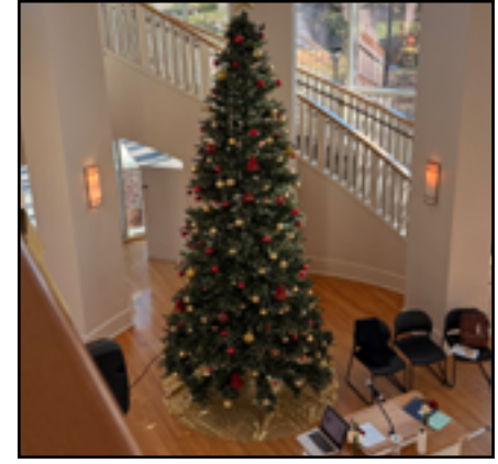
The Porter Center gets ready for the holiday season by setting up a Christmas tree.

Many families are still trying to recover from Hurricane Helene and Milton, whether that's due to not being able to work or not having a home or motor vehicle. The hurricanes affected over 100,000 people, and donations will give families something they can look forward to, despite having to overcome these tremendous obstacles.