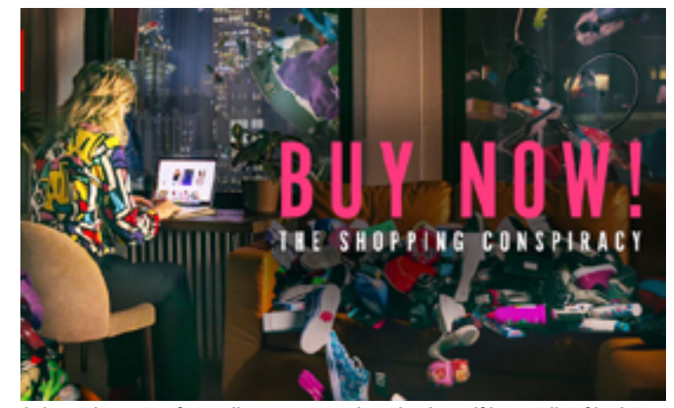
A dramatic sense of an online customer shopping herself into a pile of junk.

An example of this is Coca-Cola, accused of