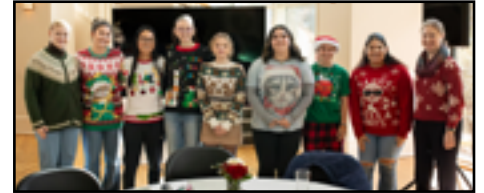
Students "compete" in an ugly sweater contest.

There was also Christmas themed trivia that