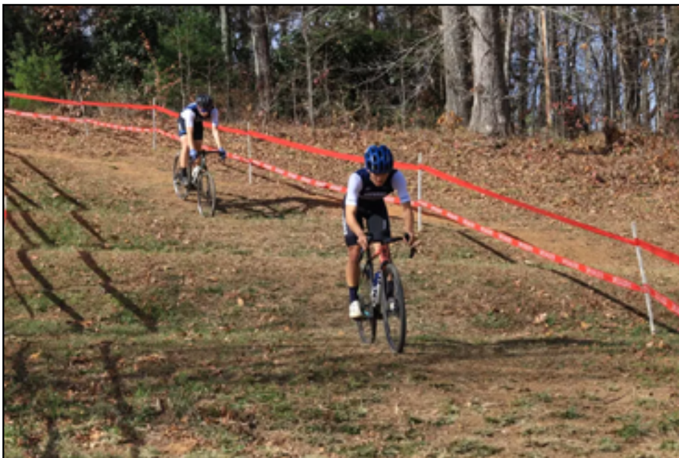
BC Cycling photo by Dustin Vanover.

For more information on the 2024 USA Cycling Cyclocross National Championships visit the USA Cycling event page or https://my.raceresult.com/318047/results .