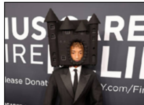
Jaden Smith, dressed in Louis Vuitton