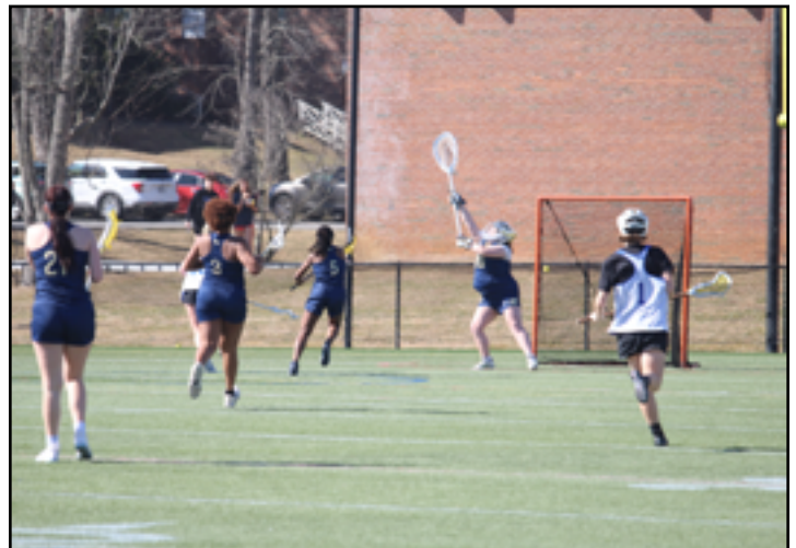
Above: Brevard in action against Montreat