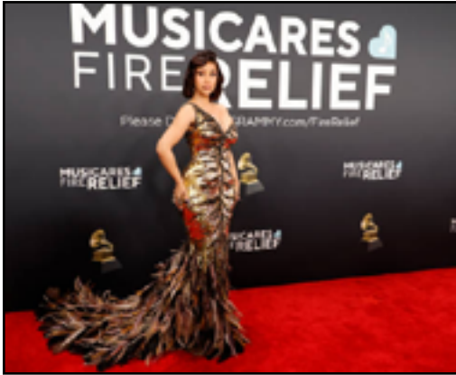
Cardi B, dressed in Roberto Cavalli.

Fashion statements at Sunday's awards ceremony in Los Angeles