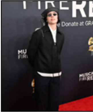
Billie Eilish, dressed in Prada