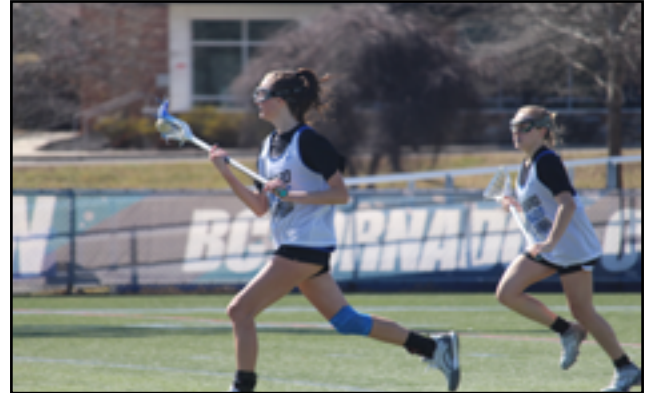
Above: Brevard Women's lacrosse players carry the ball in their scrimmage against Montreat

The Brevard College Women's Lacrosse team's first match of the season will be on Saturday, Feb. 15, and will be against Guilford College in Greensboro, so don't miss out on this exciting season.