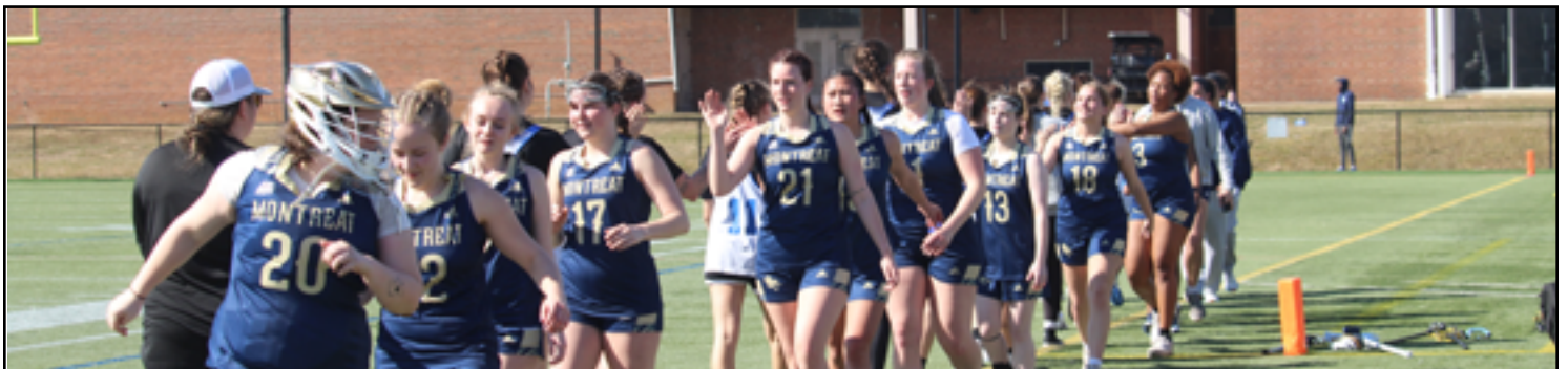
Montreat and Brevard shake hands after the scrimmage