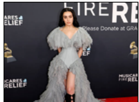
Charli XCX, dressed in Jean Paul Gaultier.