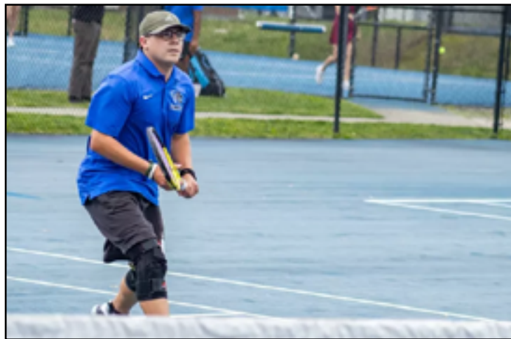
Brevard College tennis athletes competing