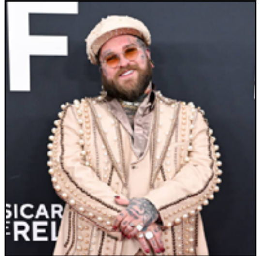
Teddy Swims, dressed by Kay Jewelers.