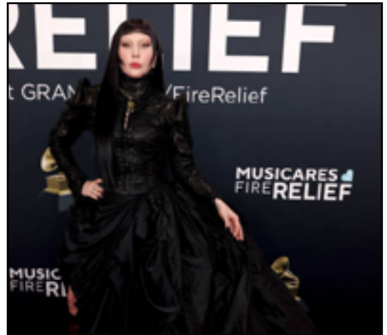
Lady Gaga, dressed in Samuel Lewis.