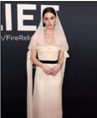
Gracie Abrams, dressed in Chanel.