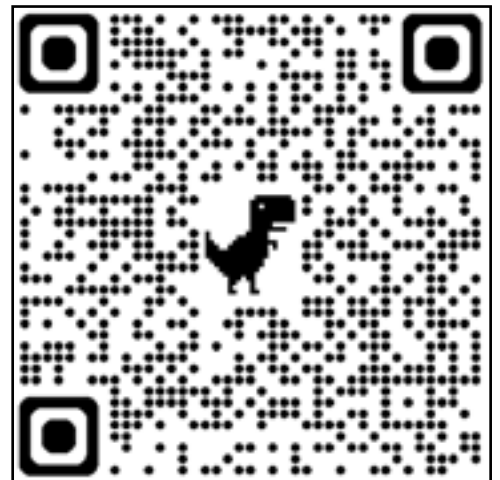
QR Code that takes you to the datasheet.

Collecting trash for this initiative can also count towards student volunteer hours, so if those are needed for a class or program, consider participating!