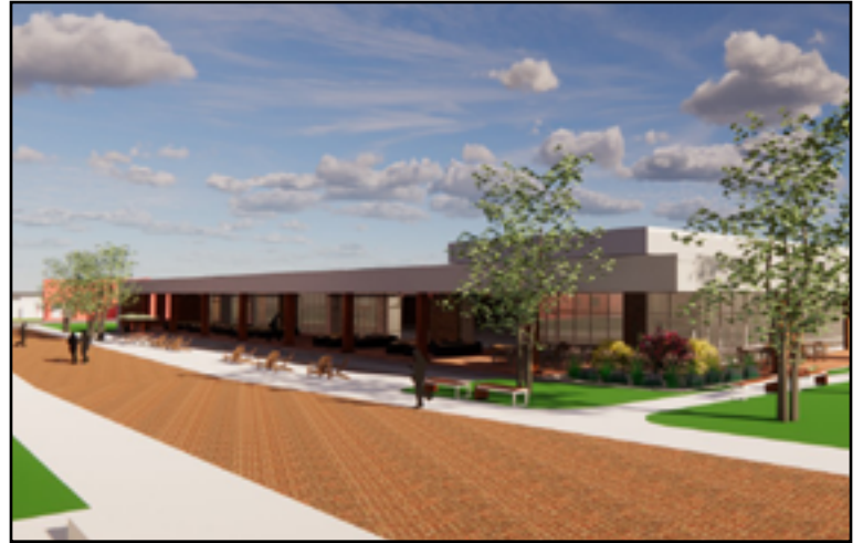
The new Student Center and Campus Plaza at Brevard College will transform the center of the campus into a holistic experience for students. Image credit: Credo Design Architects.

The project came to fruition after an exhaustive process of surveying Brevard College students about potential physical improvements on campus. Common themes