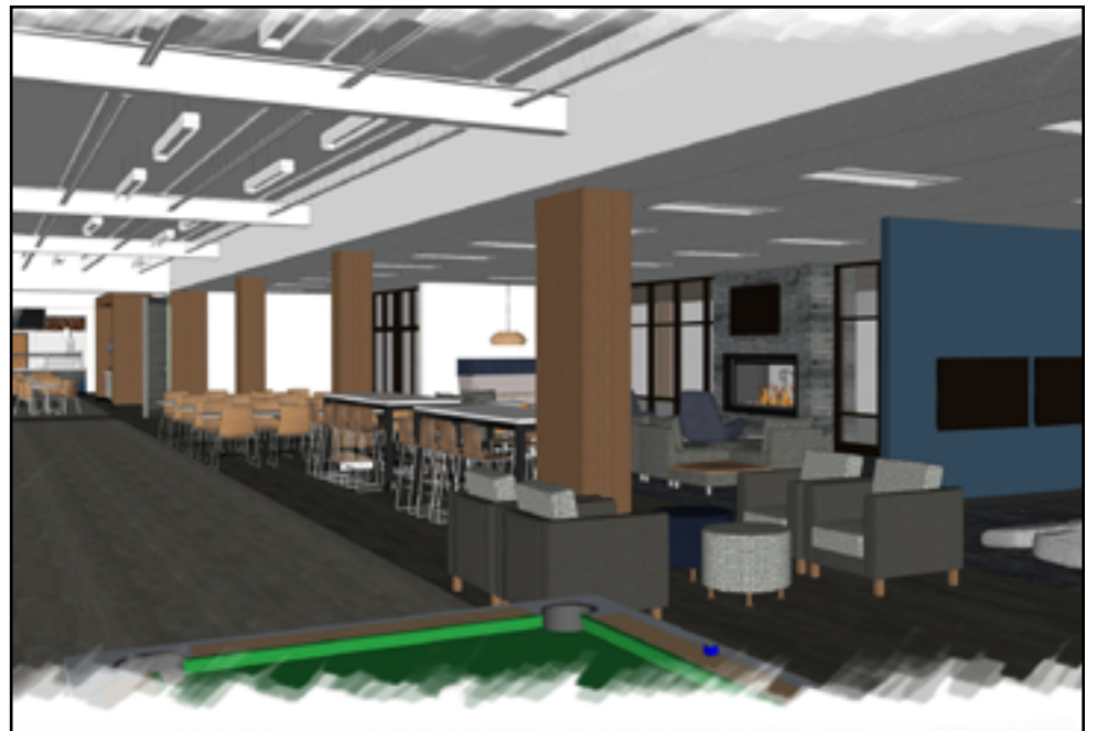
The interior of the Student Center will include significant lounge and game areas for students to enjoy as well as new dining facilities. Image credit: Credo Design Architects.

✉ Letters Policy: The Clarion welcomes letters to the editor. We reserve the right to edit letters for length or content. We do not publish letters whose authorship cannot be verified.