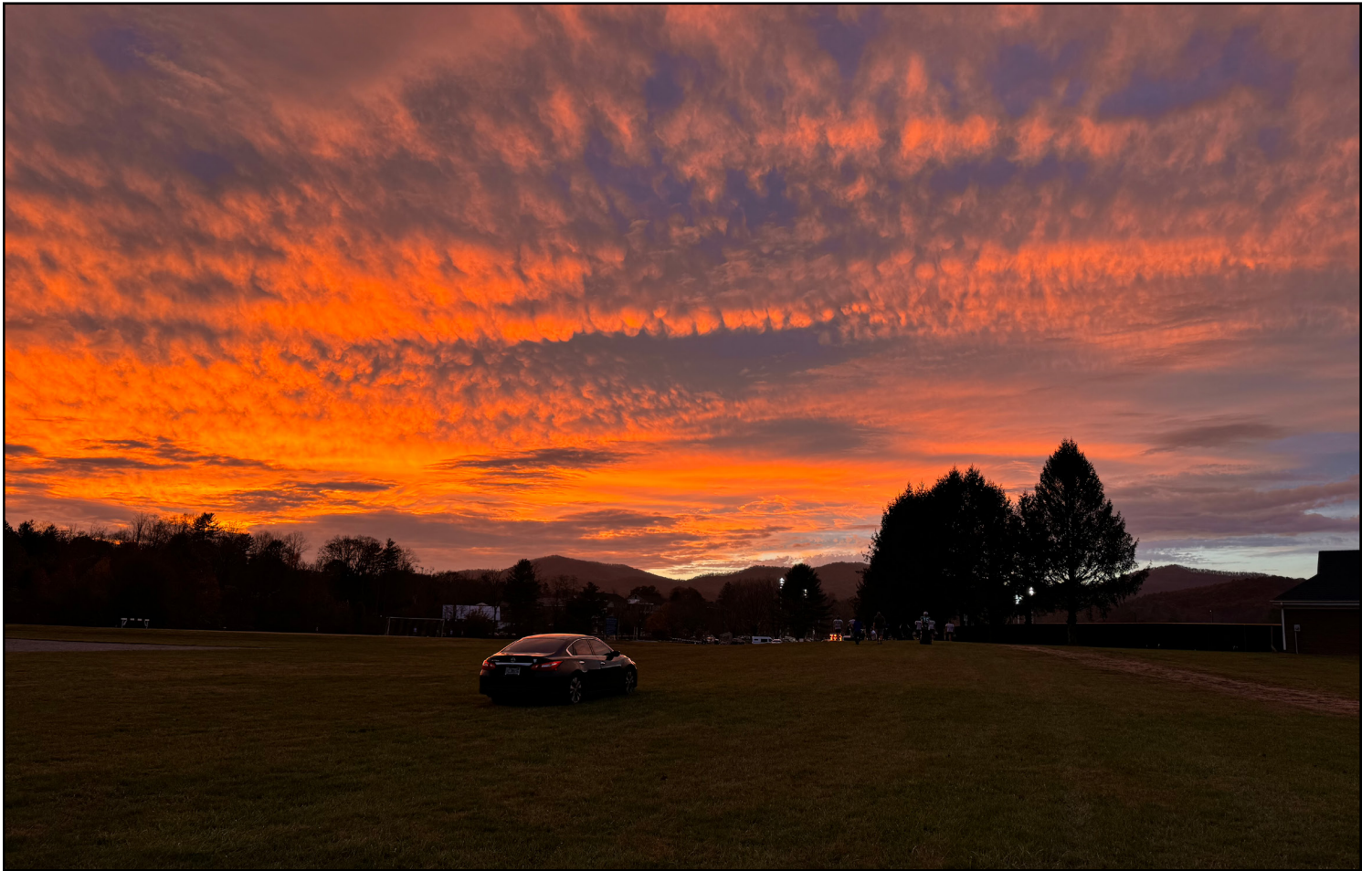
Sunset over the Pisgah mountains grass fields near softball field Brevard college.