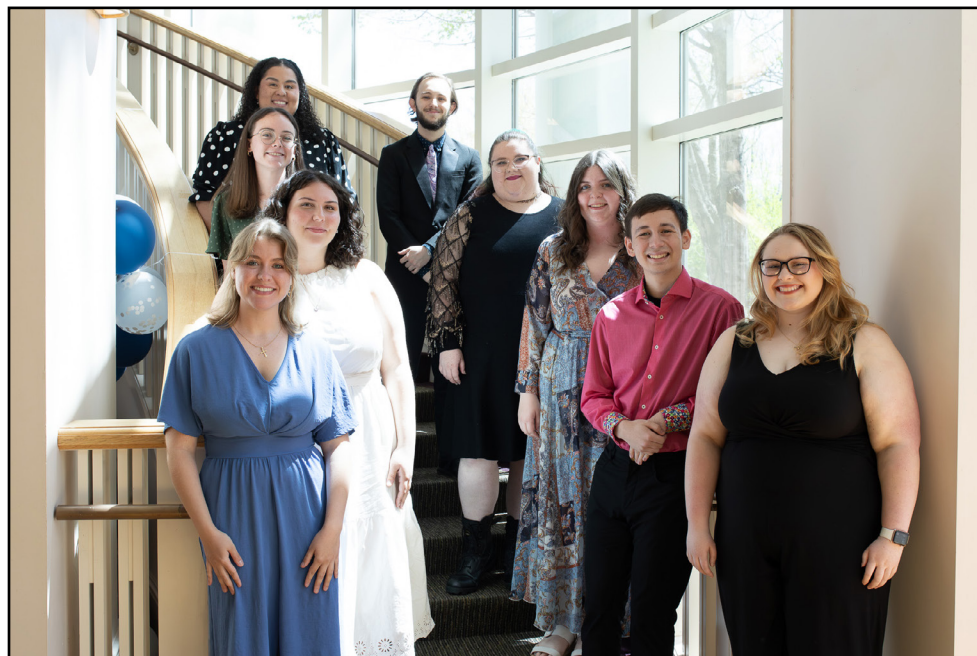
Fine Arts graduating seniors.

Excellence in Religion and the Arts: Gabriella