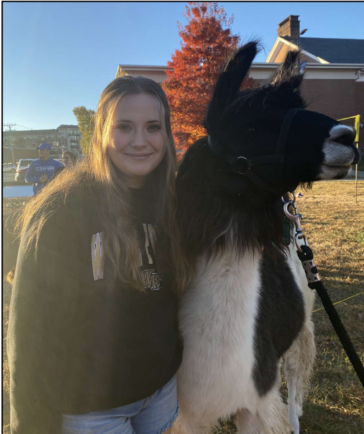
Llamas Fall of 2022.