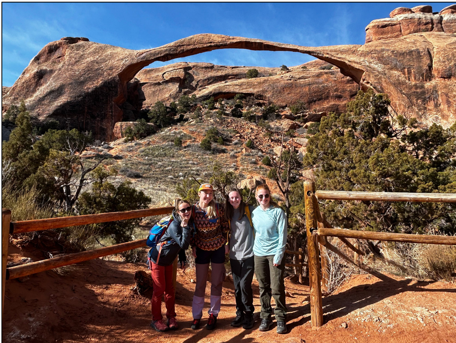
Arches National Park - Spring 2024.