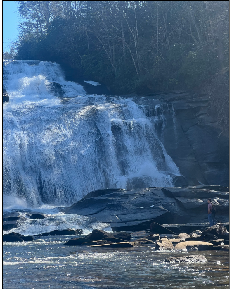
On a field trip for Deep Time class.

A video of these photos will be available on the Clarion's YouTube channel at www.youtube.com/@bcclarion .