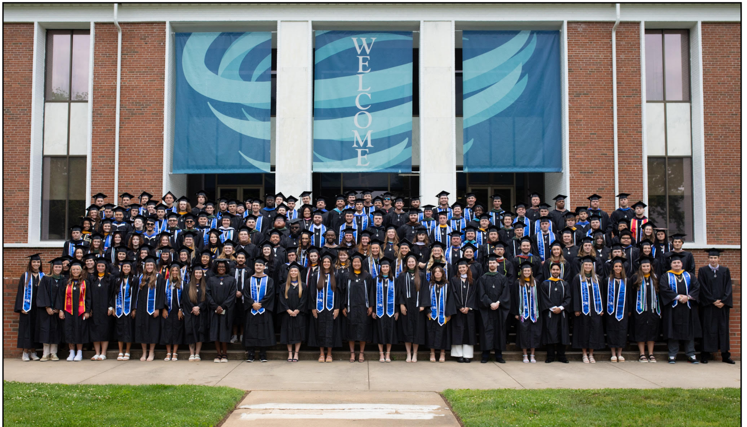
As is traditional, members of the BC Class of 2025 posed on the steps of Jones Library for a class photo the morning of commencement May 9.