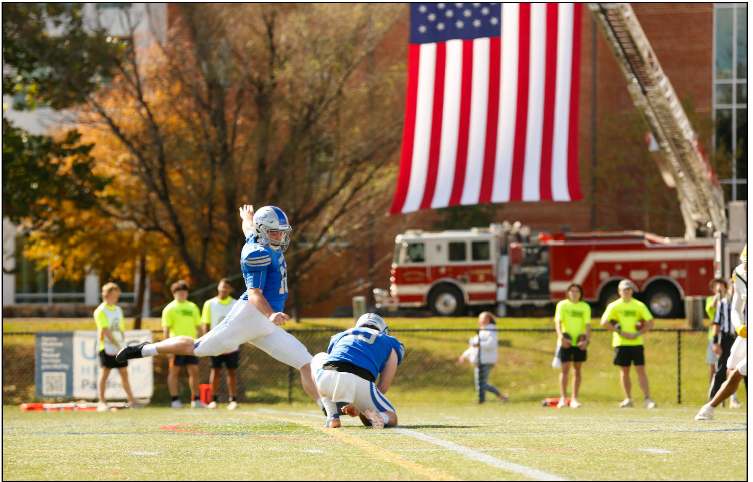
Kicking at Brevard College on senior day.

My favorite memory from Brevard College was going to little sliding rock during freshman orientation