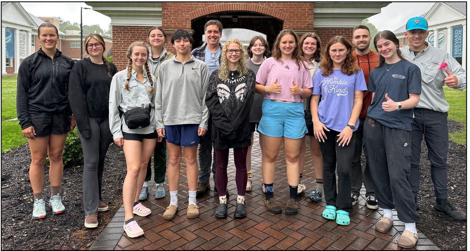
The 2025 Voice of the Rivers team. They left campus Monday, May 12 for an 18-day expedition along the Yadkin-Pee Dee River.