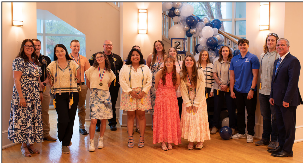
Award winners and graduating seniors from the Criminal Justice major at Brevard College.