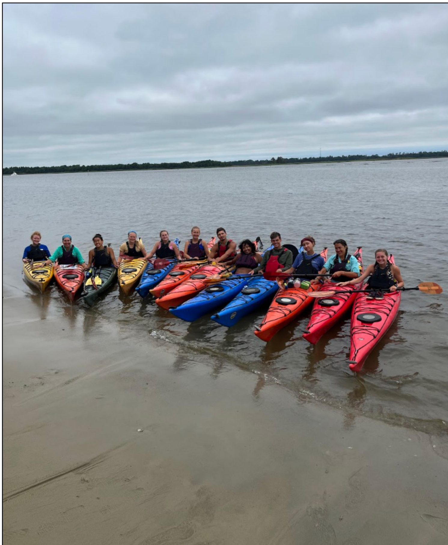
VOR - Summer 2022.