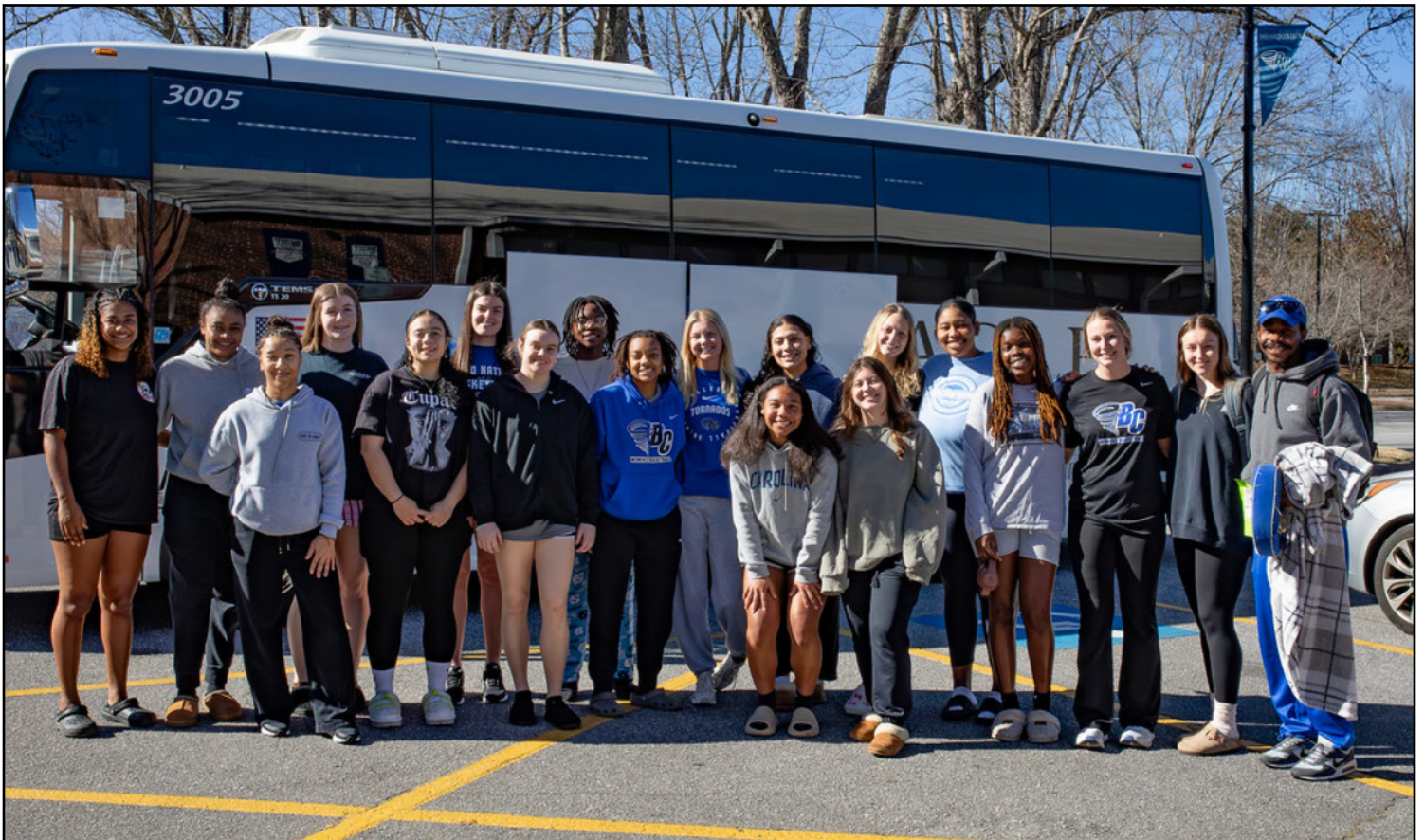
Women's Basketball team headed to the USA SOUTH championship for the 1st time ever!.