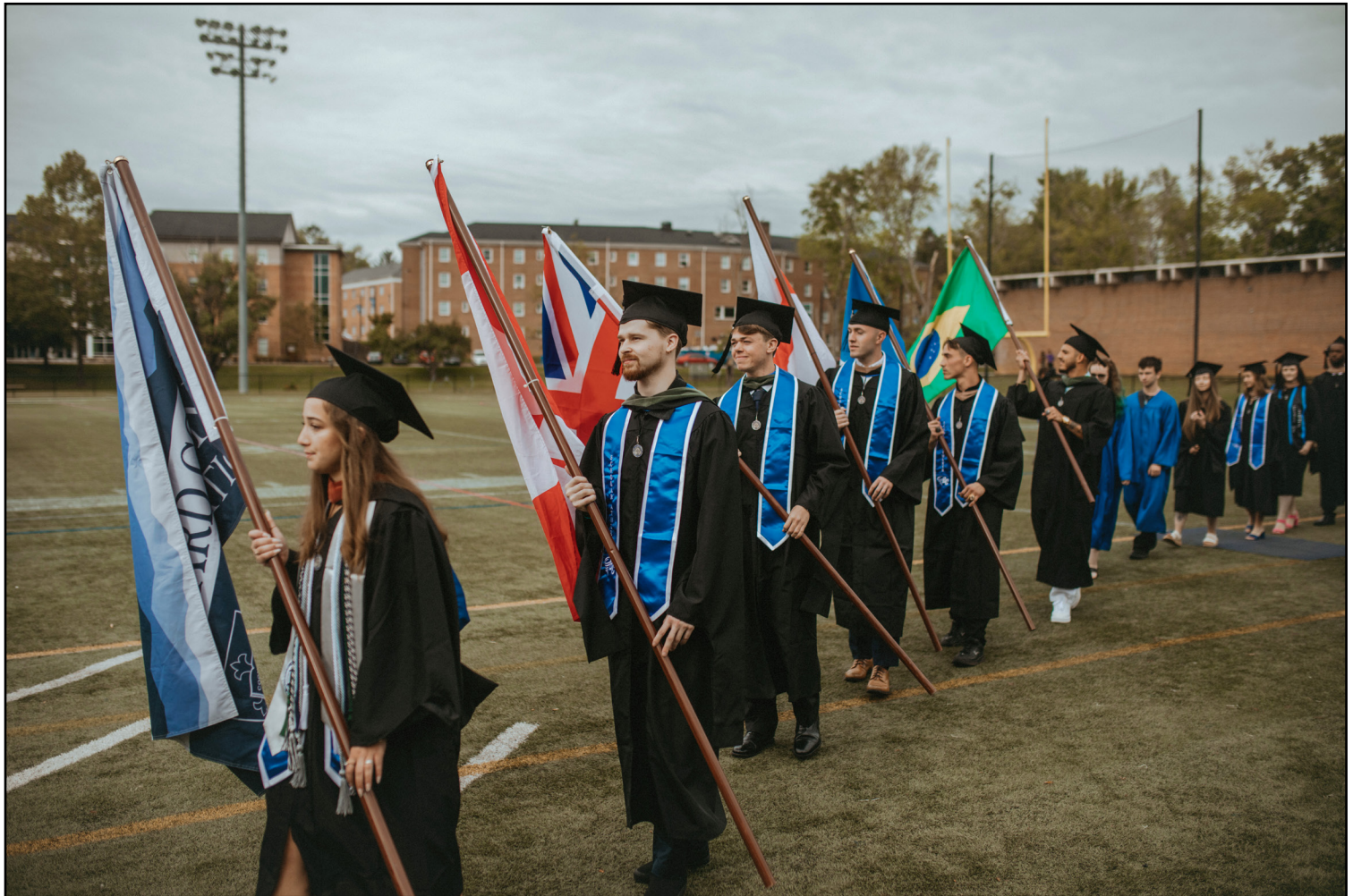
In addition to the United States, five other nations—Brazil, United Kingdom, Canada, France and Ireland—were represented by the nearly 200 graduates at this year's commencement ceremony.