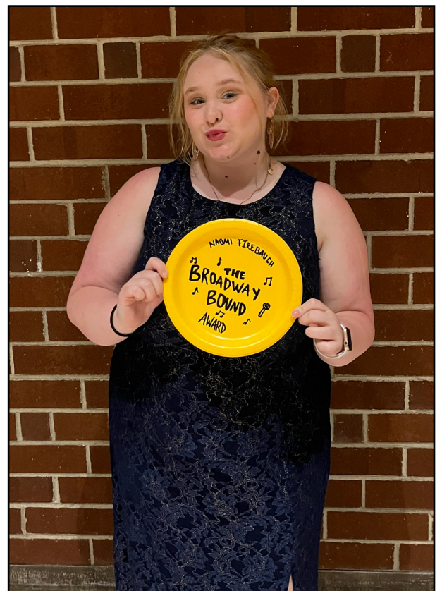
This photo was taken at the annual theatre paper plate awards my junior year, spring 2024. I loved having this hidden theatre tradition because it was just for the students!.