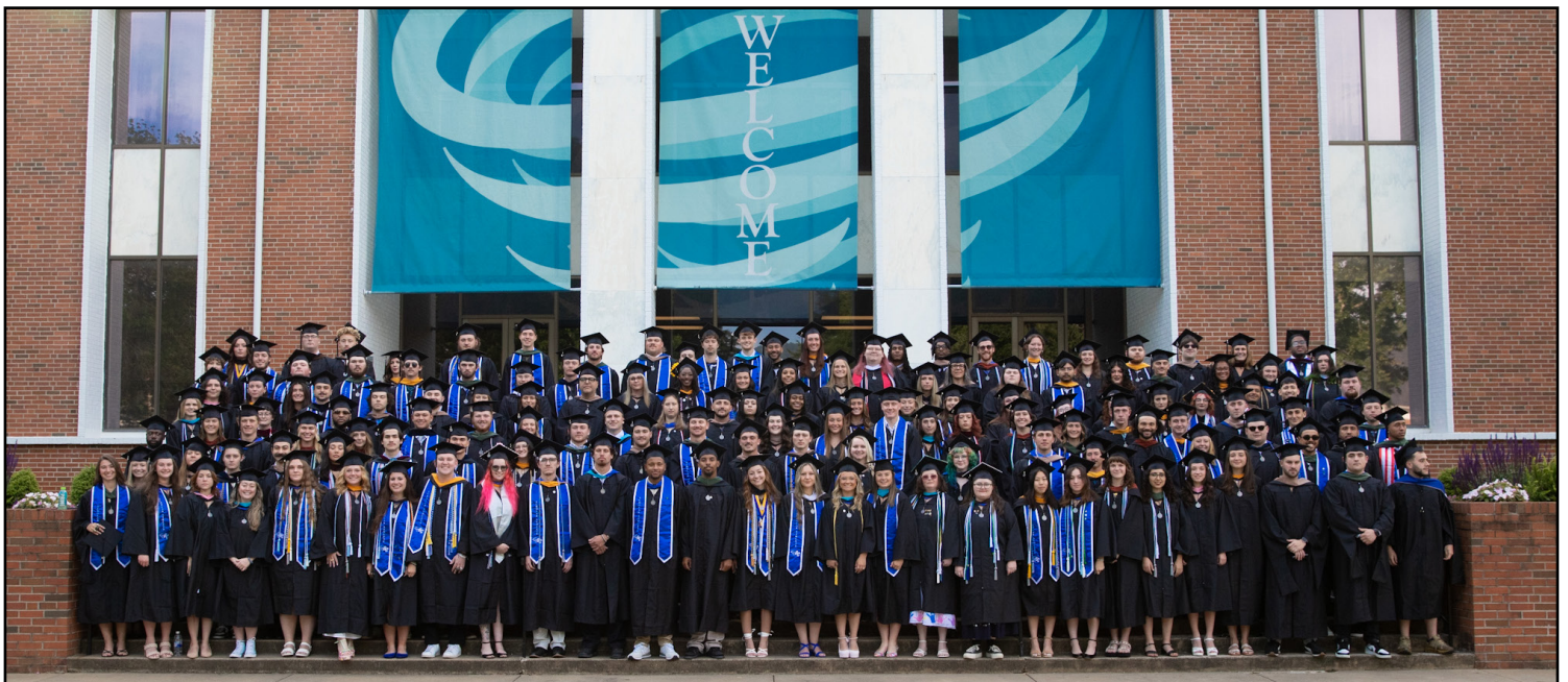
As is traditional, members of the BC Class of 2026 posed on the steps of Jones Library for a class photo the morning of commencement.