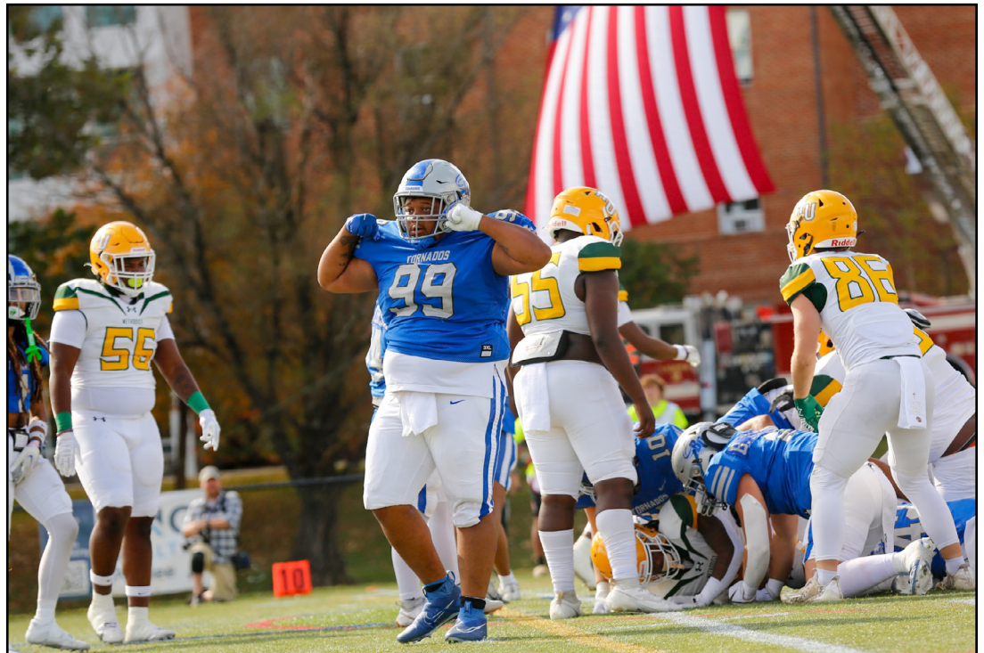
Fall 2024 football game vs Methodist after I made a big play.