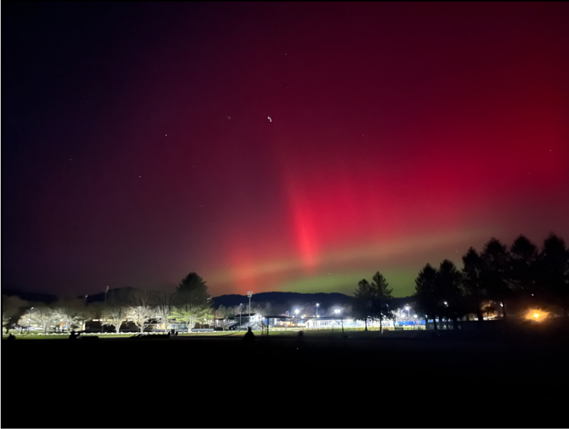
A picture of beautiful northern lights passing over Brevard College. This picture was taken out by the track on campus.

First win at home 4/0 against Covenant. —Tristan Bayssade