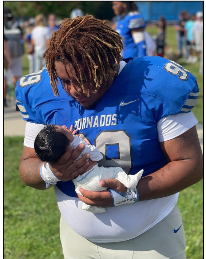
Holding my newborn daughter after our first game in 2024.

Beating Maryville in overtime my sophomore year and everyone storming the field.