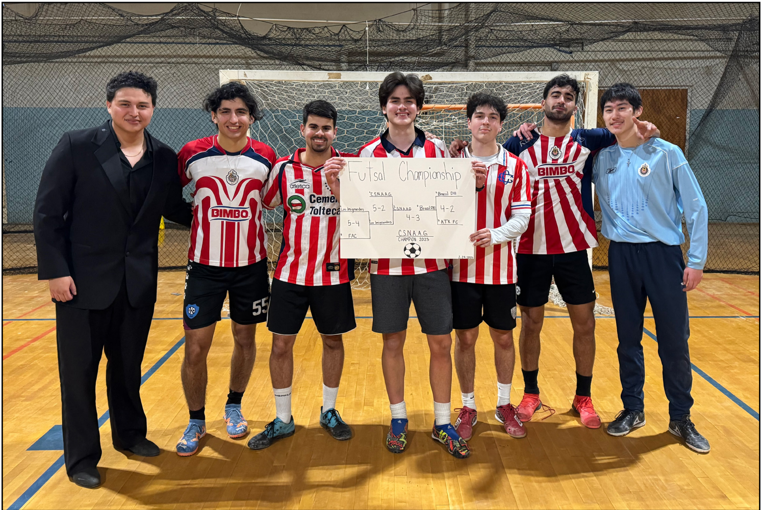
CSNAAG Futsal Tournament winning picture.