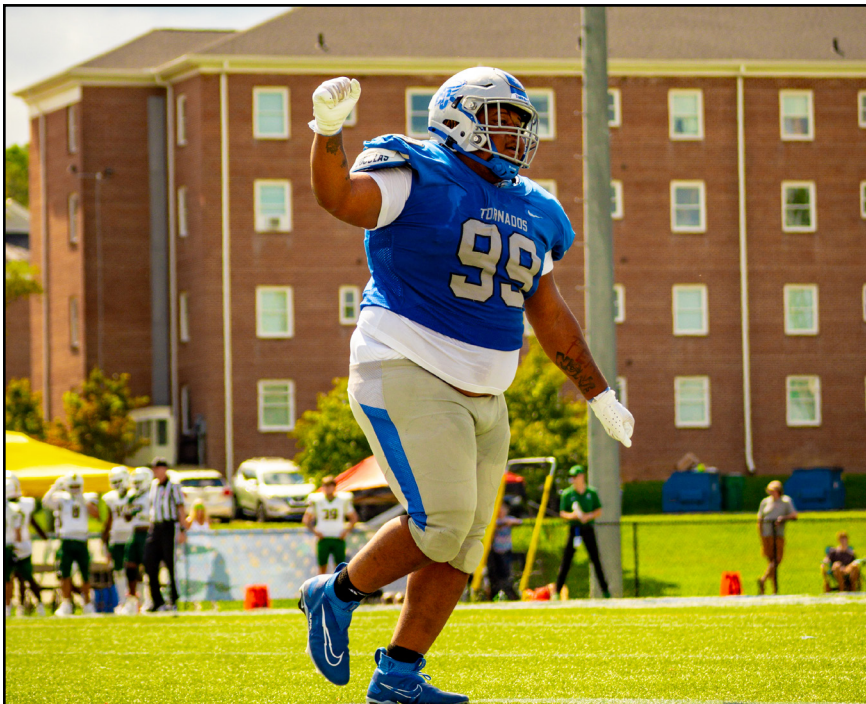
When I got my first tackle for a loss at Brevard.