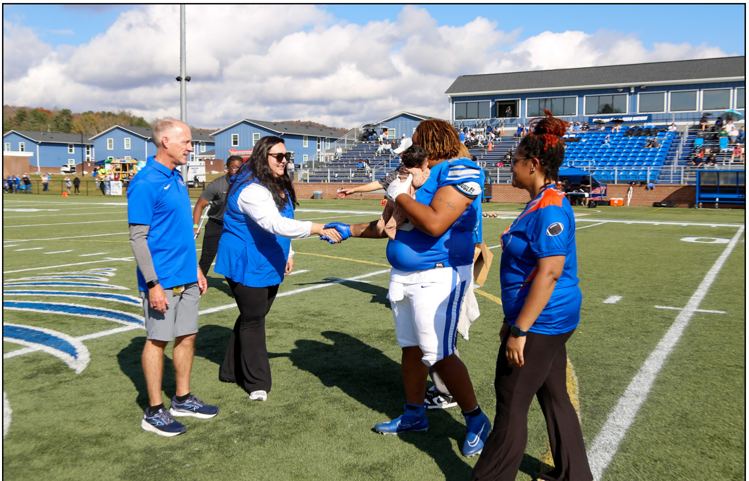
Senior game holding my daughter shaking the president and AD's hand.