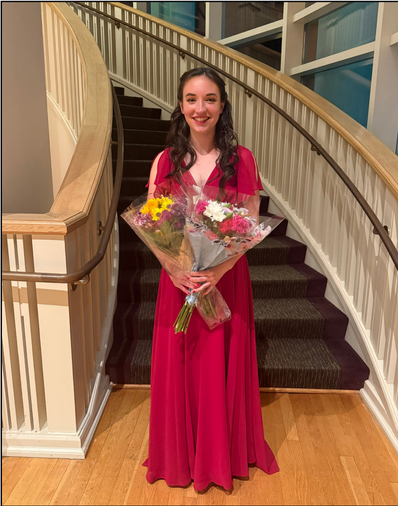
This picture is from my senior recital.