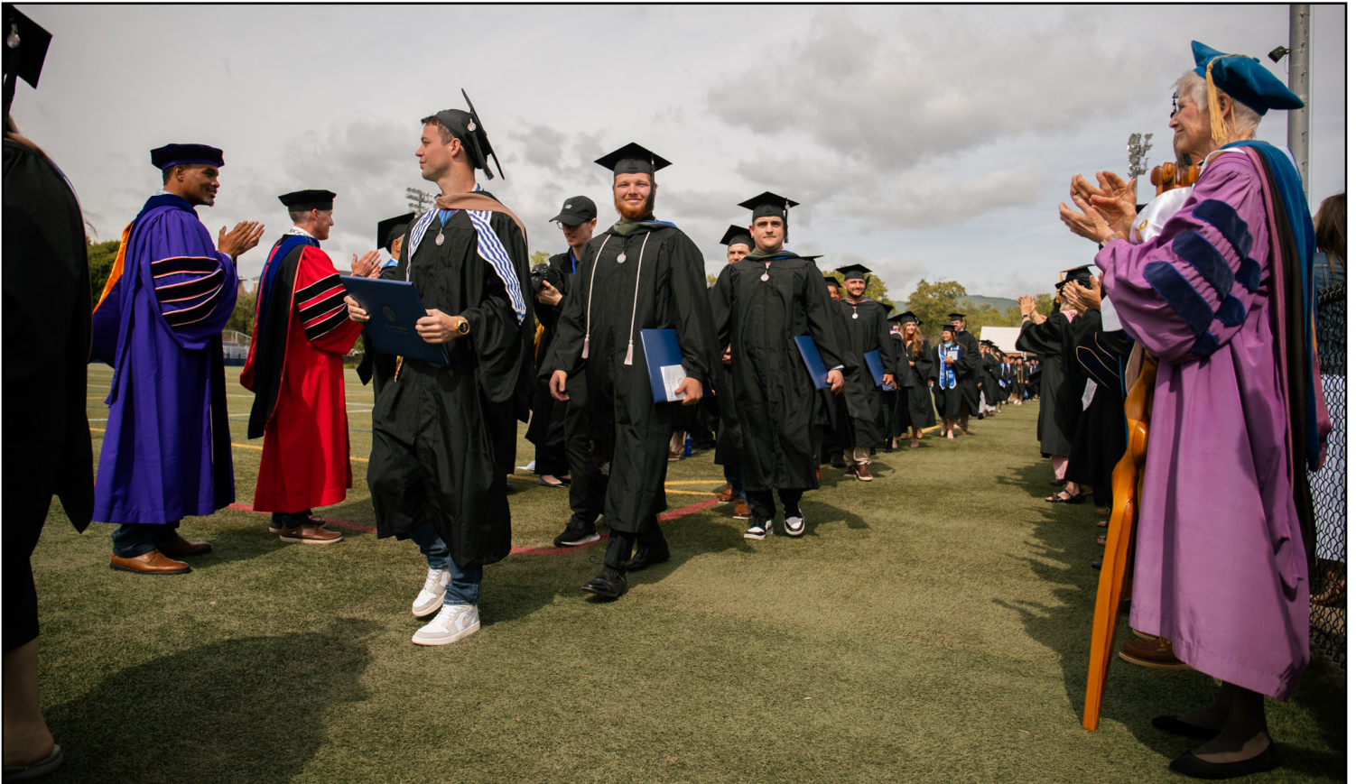
A Brevard College tradition is for new graduates to exit the field between two rows of applauding faculty.