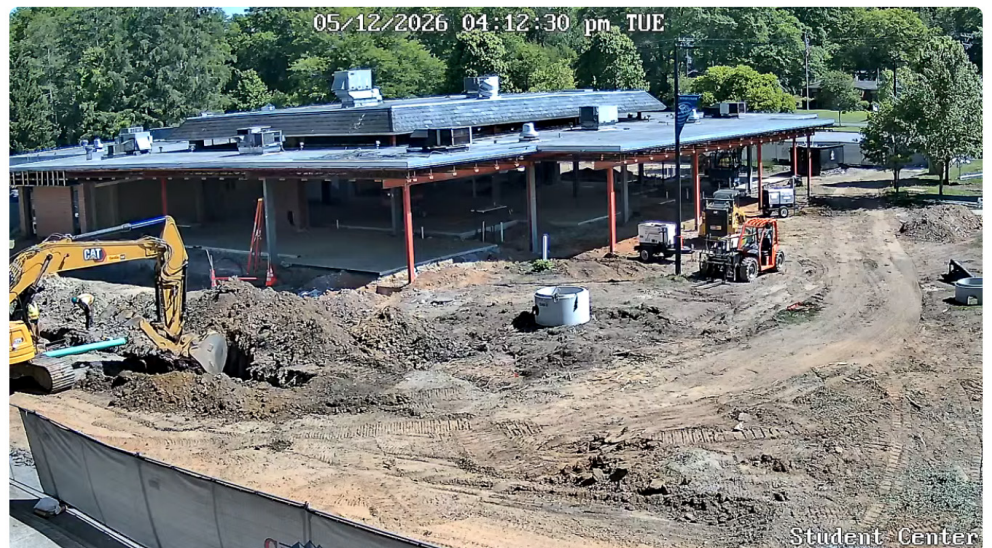
A view of the construction of the new student center on earlier this week. Visit http://www.youtube.com/@BrevardCollegeConstructionLive to check on construction anytime.

To find out more about the new student center—or to make a donation—visit https://brevardcollege-studentcenter.advancemyeducation/donate/ .