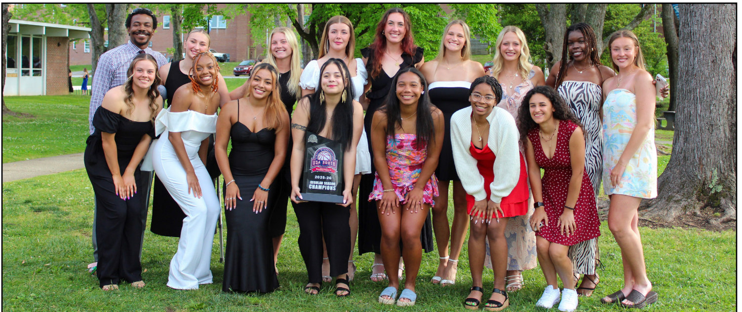
Brevard College's women's basketball players, winners of the regular season conference championship, were among those honored at the 2026 BESPYS Awards.