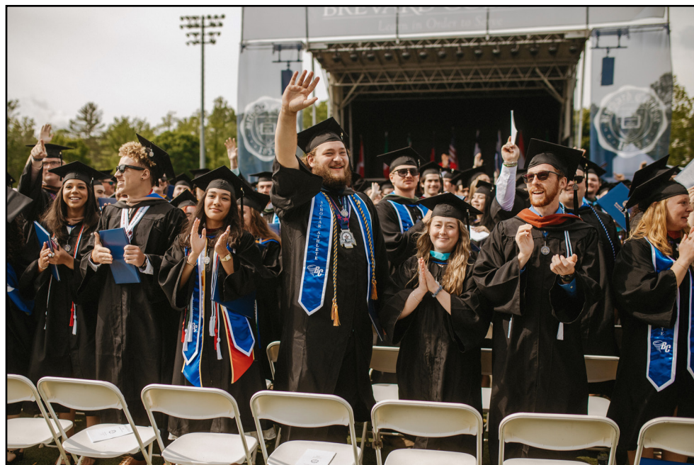
Brevard College graduates celebrating at the 2026 Commencement.