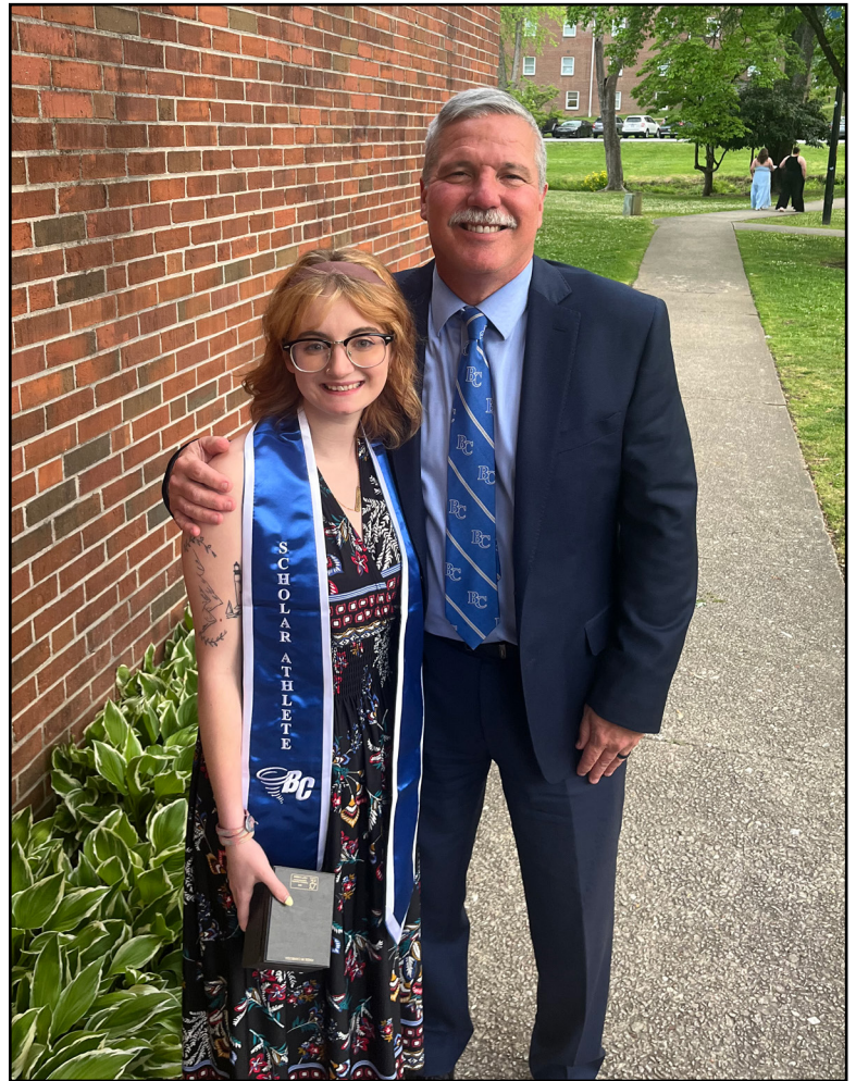
Bespys 2026.

A video of these photos will be available on the Clarion's YouTube channel at www.youtube.com/@bcclarion .