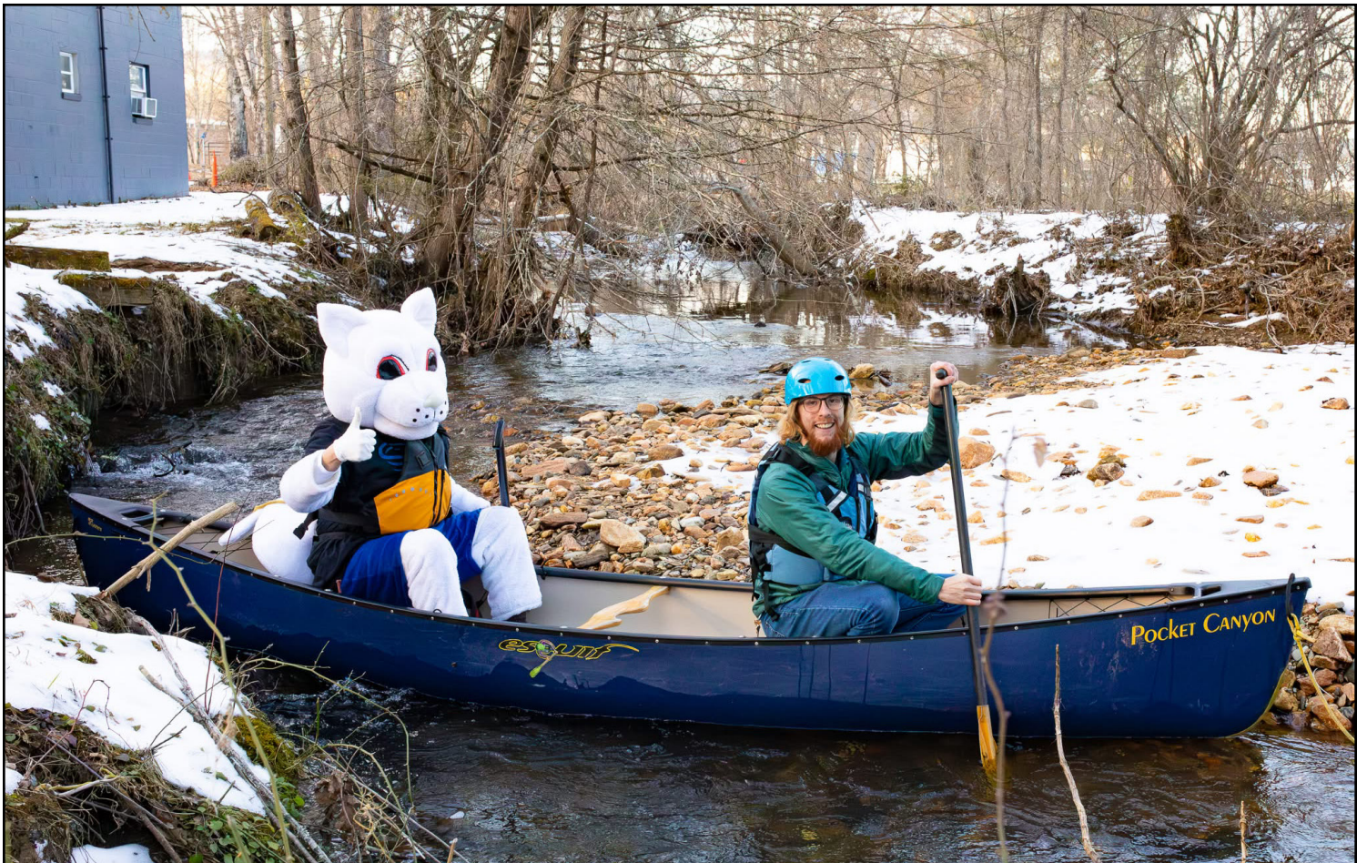
I happened to be around one day when Nado needed a paddling buddy. We had a grand ol' time.