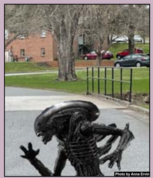
Neila, the alien, posing for a picture while on a tour of the campus about to cross the creek.

I think these wise words are something we can all learn from and take with us through the next week.