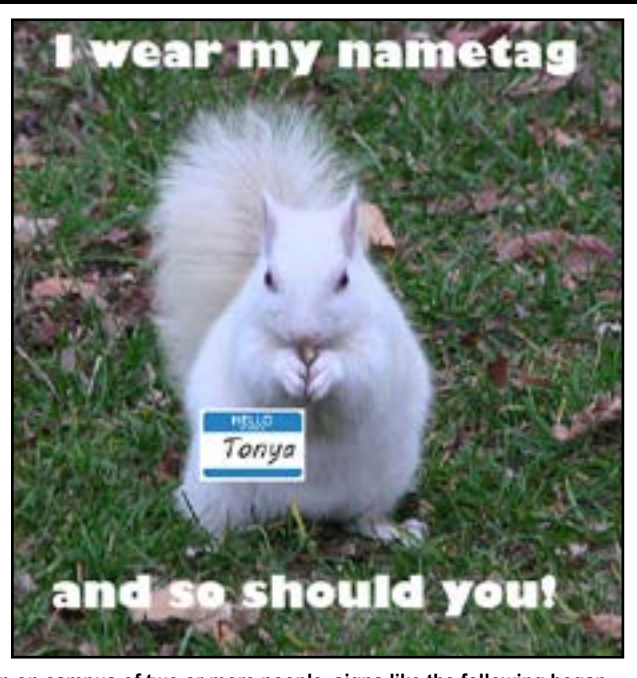
Immediately after Campus Life imposed a name tag mandate for any group on campus of two or more people, signs like the following began appearing on campus.