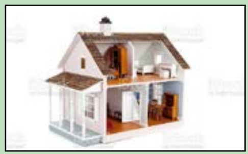
A rendering of what Jones Hall will look like after rennovations, and the foundation for every other dorm roof.

Although the residence hall has technically been closed since the collapse happened, students and administrators have been free to enter and exit as they please to observe the damages. In doing so, people have noticed that