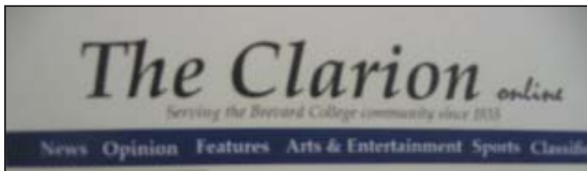
The Clarion remains online in the fall 2004 semester, but the future is looking up