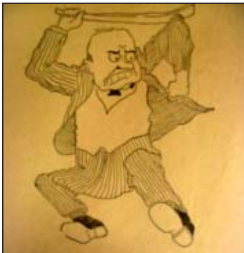
A cartoon in Vol. 1 portrays a Professor rallying school spirit