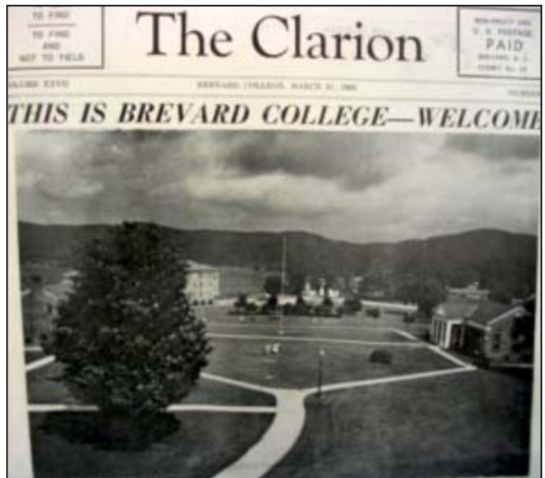
The Clarion is used as a recruiting tool in 1960