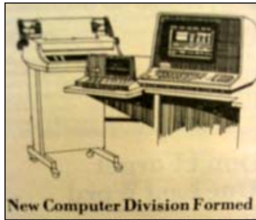
New Computer Division Formed