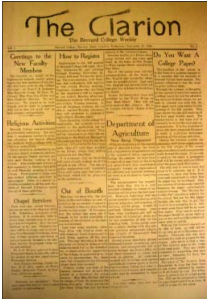
The first issue of The Clarion was released on September 25, 1935

A CLUB FOR ALL THE STUDENTS. A New Plan whereby every Student will get The Clarion at a reduced price.