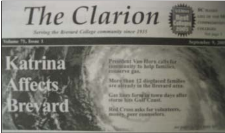
The Clarion covered the effects of Hurricane Katrina in its first issue of the fall 2005 semester