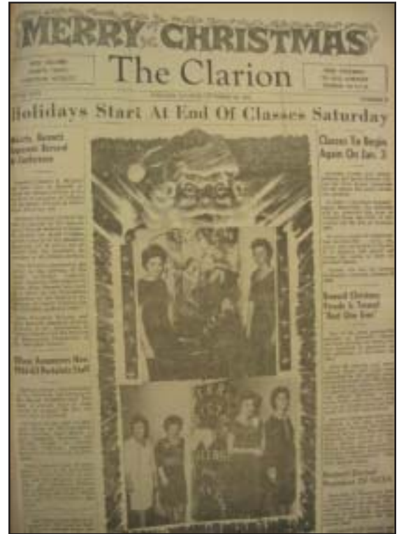
Christmas of 1963 celebrated in The Clarion