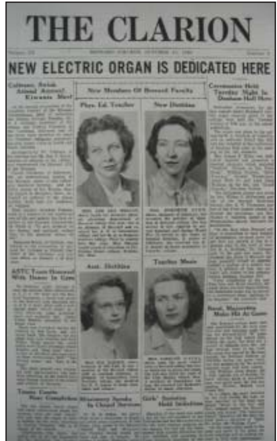
The Clarion printed photographs frequently by 1948