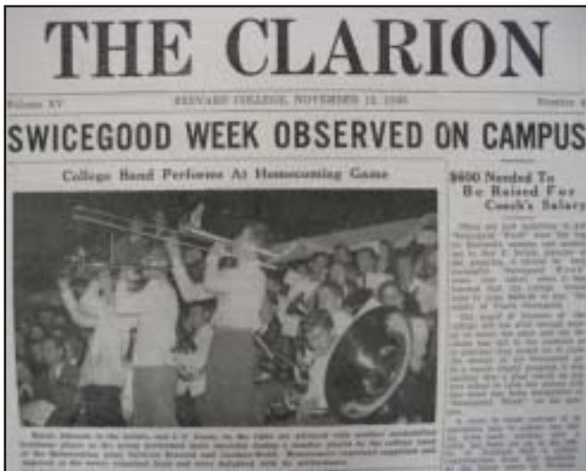
The Clarion covered the college band at a student activity in 1948