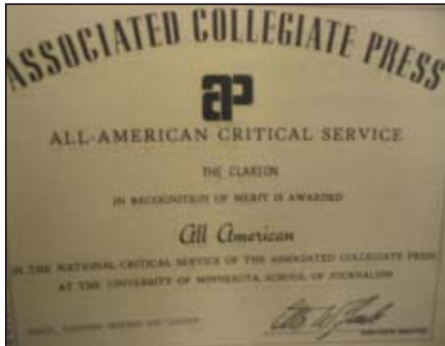
The Clarion received an All American Rating in 1970