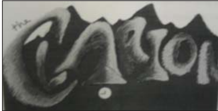
The first online banner of The Clarion