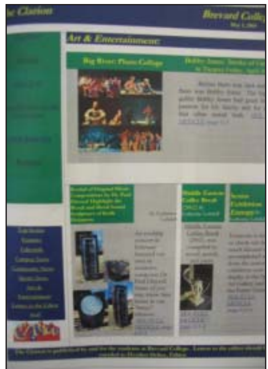
The online edition of The Clarion in spring 2004