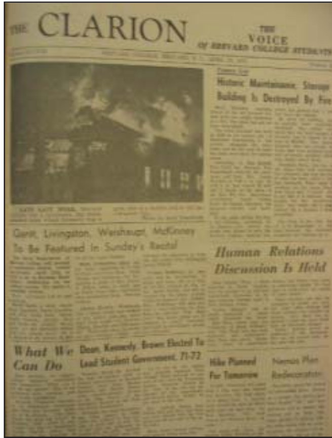
By 1975, The Clarion had evolved with modern journalistic layout trends