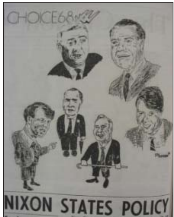
Nixon was the student favorite in the 1968 Presidential Election