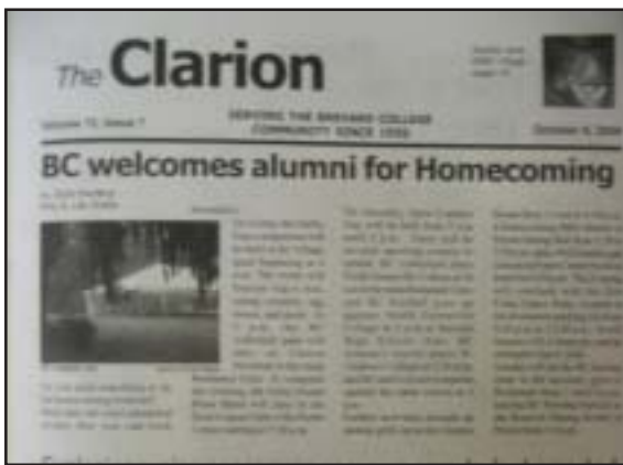
The Clarion became a weekly paper in 2006