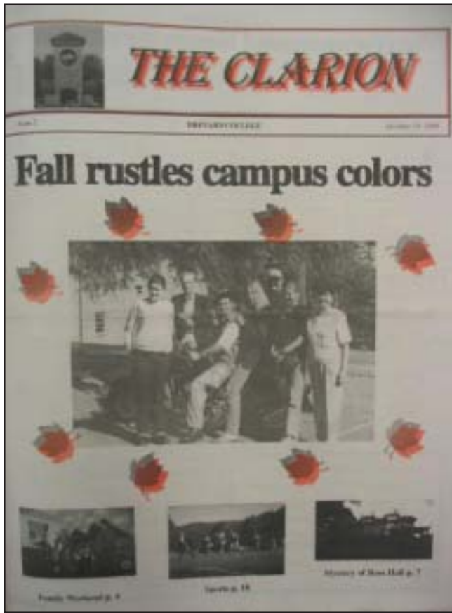
The Clarion begins to look less like a newspaper in 1999