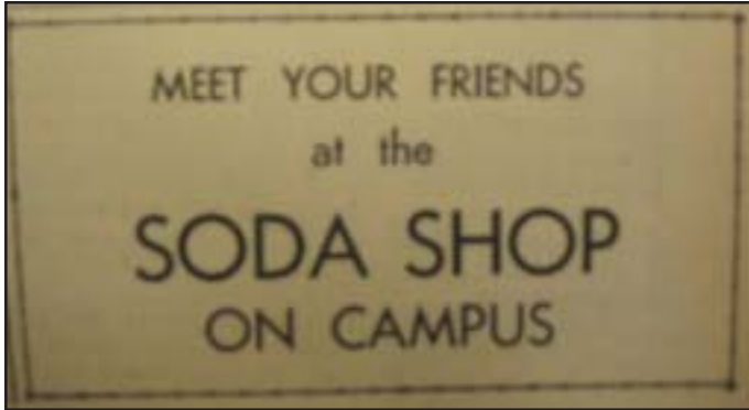
The Brevard College Soda Shop was a popular hangout in 1963