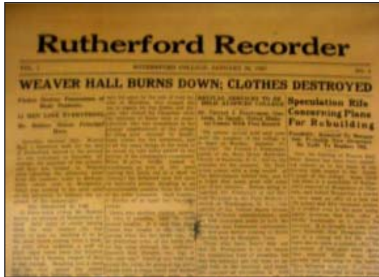
The Rutherford Recorder reports on the fire in Weaver Hall