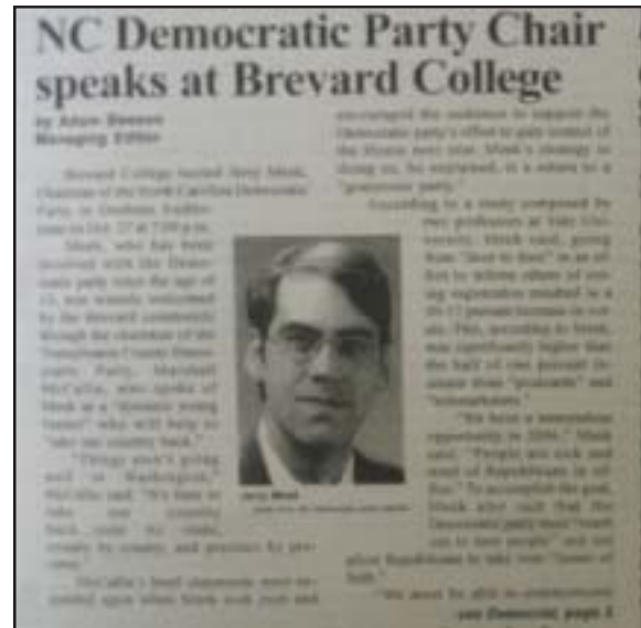
The Clarion returned to covering newsworthy issues in 2005