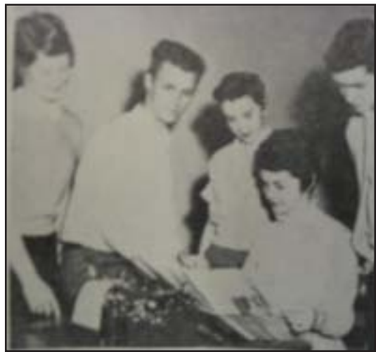
The Clarion staff work on an issue in 1958