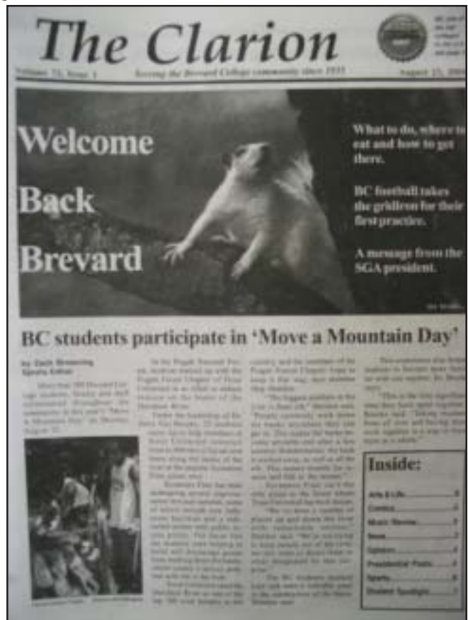
My first issue as editor-in-chief of The Clarion