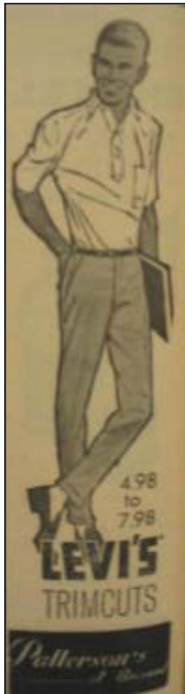
An ad for Patterson's in 1963