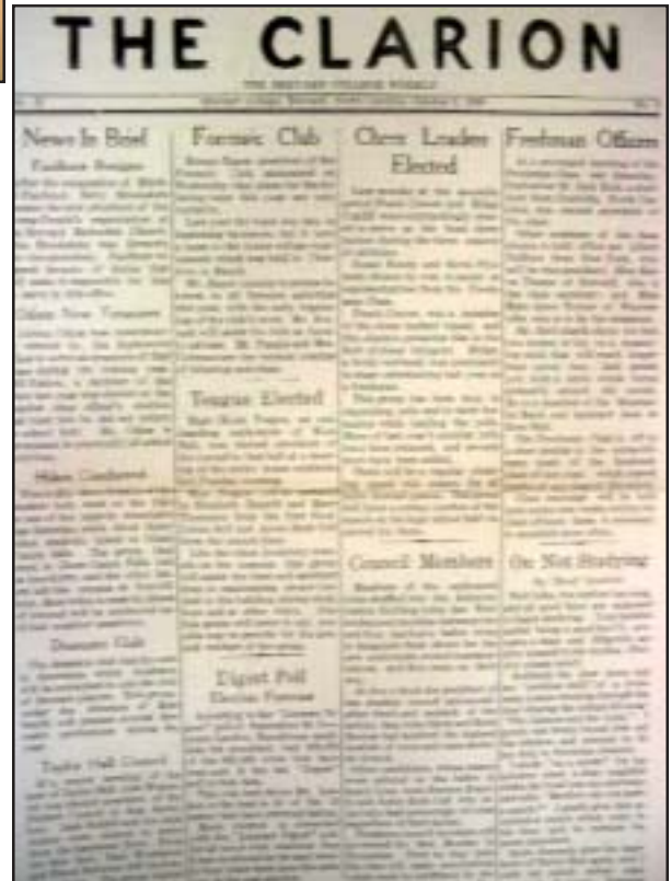
Vol. 2 brought a new visual style to The Clarion