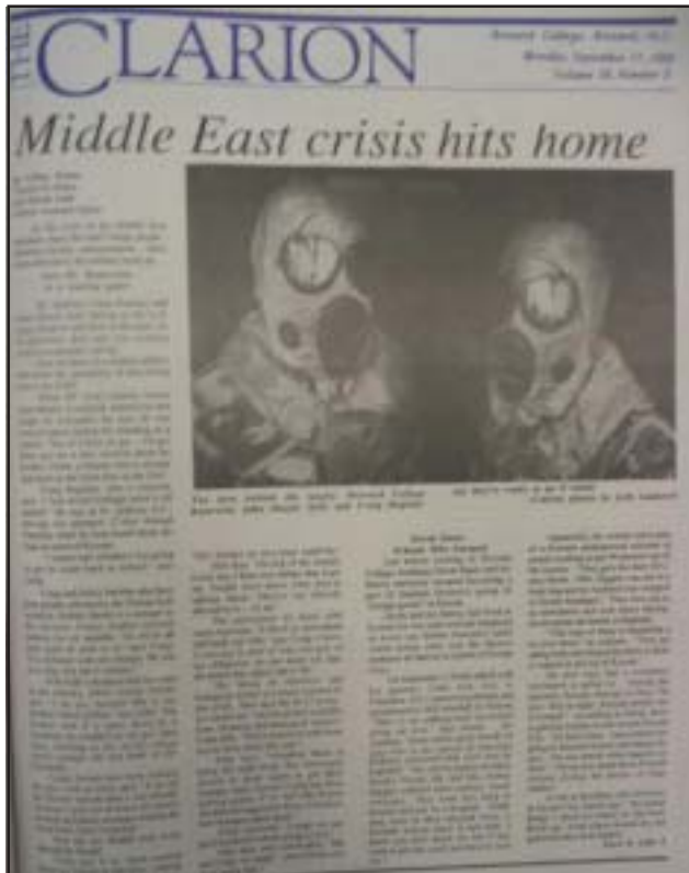
The Clarion reports on student involvement leading up to the Persian Gulf War