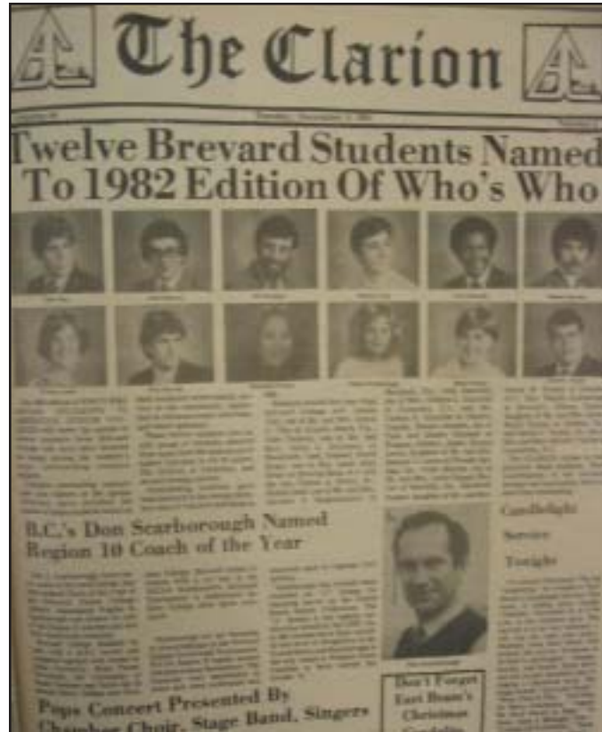
The Clarion changes its banner in 1982