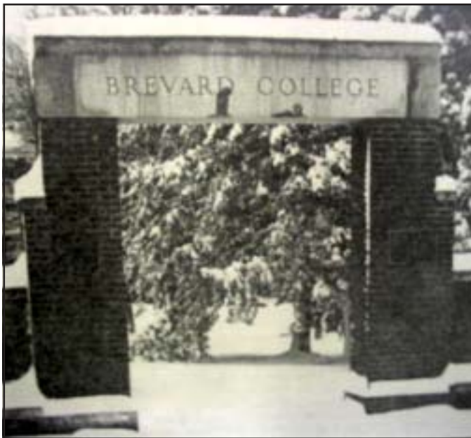
The entrance of Brevard College in 1958