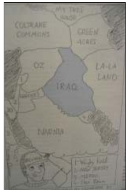
A student's cartoon at the start of the war