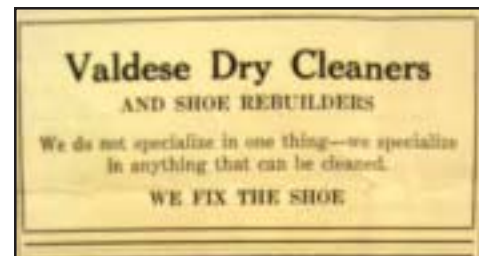
An ad in The Rutherford Recorder in 1927