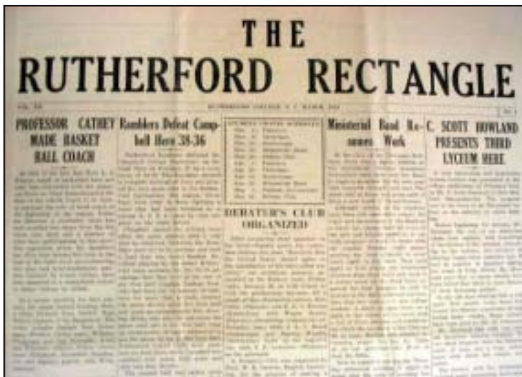
A late issue of The Rutherford Rectangle in 1933