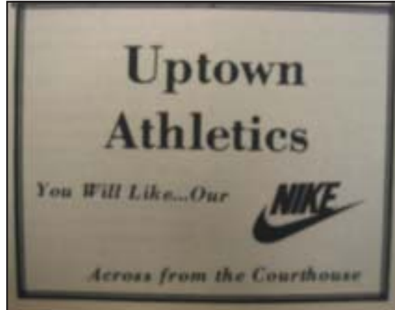
An ad in a 1982 edition of The Clarion