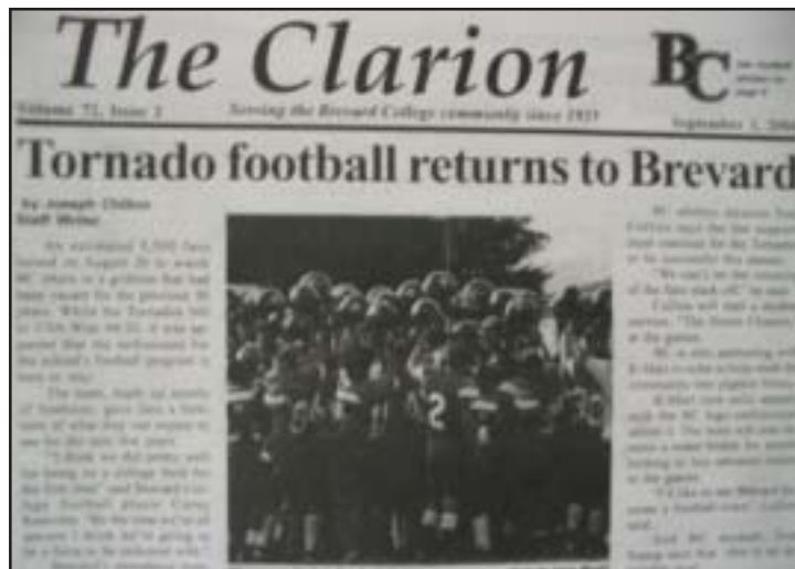
The Clarion reported on the return of football to Brevard College in the fall 2006 semester