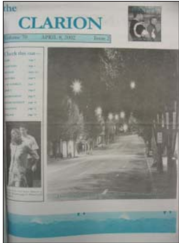
The second of two issues released in 2001-2002