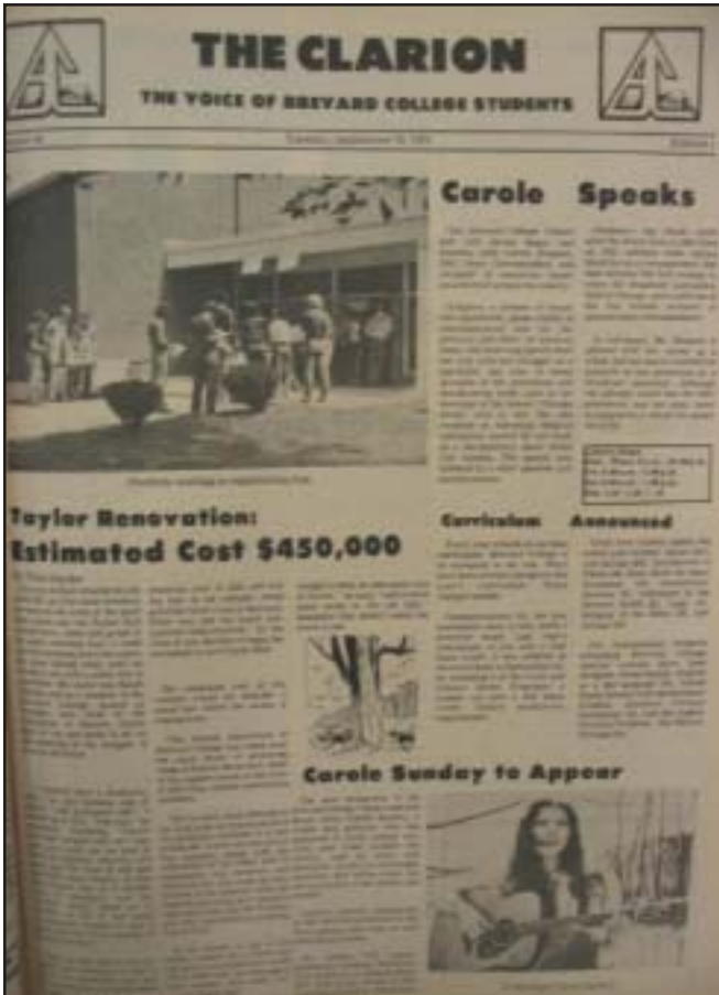
The Clarion had changed stylistically in 1978