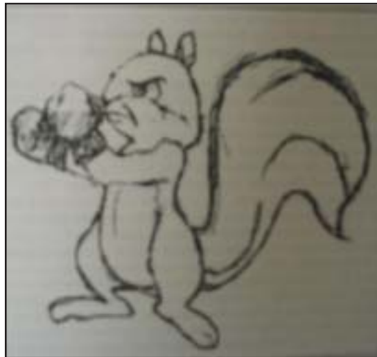
I triggered a campus-wide search for a new mascot in 2005