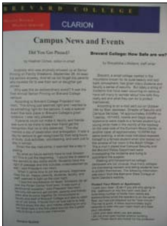
The Clarion becomes completely online in 2003