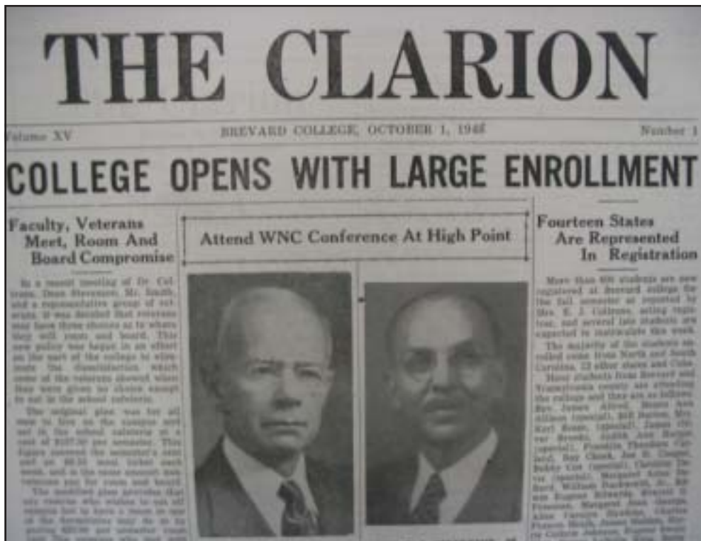
Brevard College's enrollment increased after World War II, as this 1948 headline reads