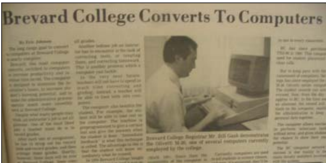
The Clarion reported on Brevard College's transition to computers in 1984